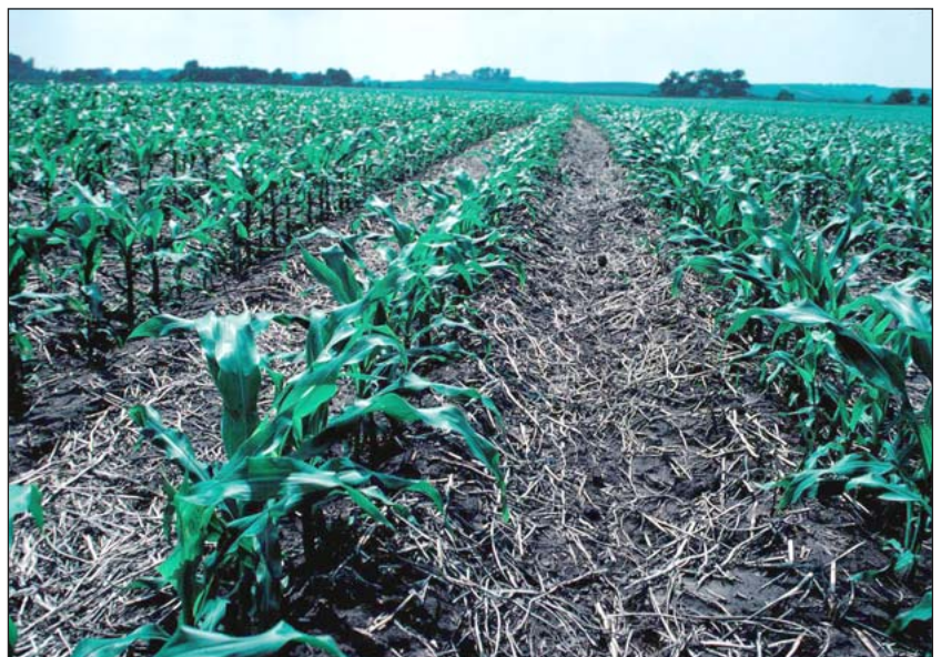
Corn planted into no-till soybean residue.

Ethanol’s supporters often reply that these criticisms are really complaints about corn-growing techniques, not about ethanol. Ethanol can be made from raw materials other than corn. Corn can also be grown more sustainably, using techniques such as “conservation tillage” to reduce erosion, as well as crop rotations, compost, and manures (both animal and plant) to maintain and enhance soil quality.