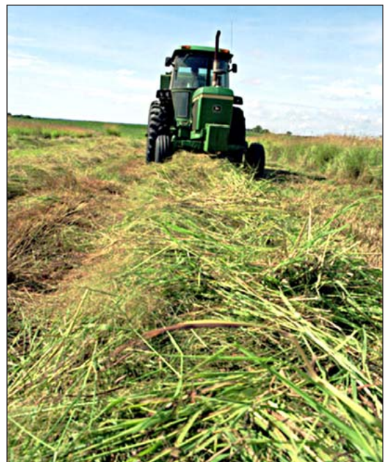
Harvesting switchgrass.

1. If state-of-the-art and next-generation technologies are considered, the energy balance criticism of ethanol looks very weak. The energy balance of ethanol has improved and will likely continue to improve. Since 1980, ethanol plants have reduced energy inputs per gallon by about 50 percent, while U.S. corn farmers have increased their yields by 40 percent and reduced their fertilizer usage by 20 to 25 percent. (Morris, 2005) (Nitrogen fertilizer accounts for around 40 percent of all energy inputs in corn farming.) Cellulosic manufacturing processes are also rapidly improving. Whether the feedstocks are agricultural wastes (e.g., corn stover, wheat straw), forest residue (e.g., underutilized wood and small trees), or energy crops (e.g., fast growing trees and switchgrass), almost all studies agree that a mature cellulosic ethanol technology will require much smaller energy inputs than corn ethanol.