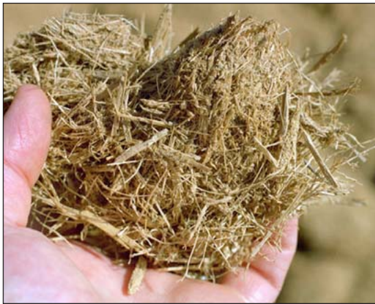
Sugar cane bagasse.

Cellulosic materials are generally less expensive than corn but also harder to convert to sugar. Chemically, cellulose is a long chain of tightly bound sugar molecules. The conversion of cellulose to sugar is generally accomplished by using sulfuric acid, through either dilute