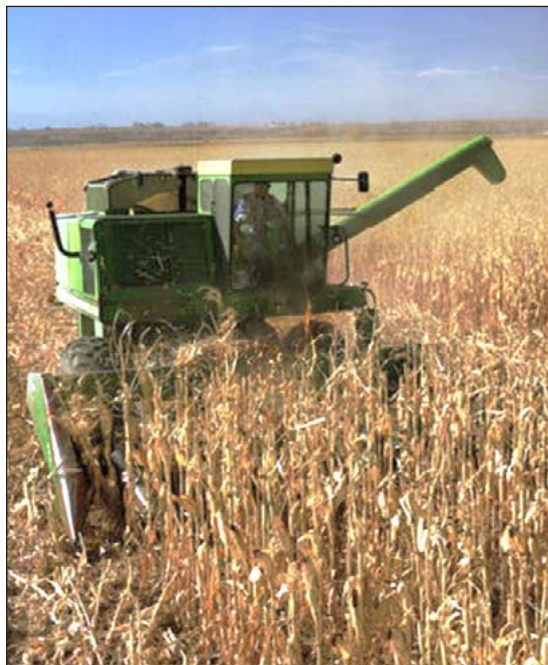
Corn stover.

Cellulose is the main component in the cell walls of plants, and is the main structural or stiffening material in plants. Cellulosic materials that can be made into ethanol are generally classified under four headings: agricultural waste, forest residue, municipal solid waste, and energy crops. Agricultural waste includes wheat straw, corn stover (leaves, stalks and cobs), rice straw, and bagasse (sugar cane waste). Forestry residue includes wood and logging residues, rotten and dead wood, and small trees. Municipal solid waste contains paper, wood, and other organic materials that can be converted into ethanol. Energy crops, grown specifically for fuel, include fast-growing trees and shrubs, such as hybrid poplars, willows, and grasses such as switchgrass.