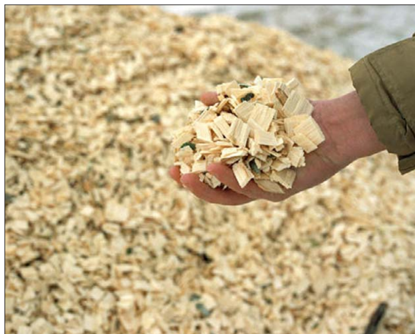
Wood chips.

According to a 2004 U.S. Department of Energy (USDOE) report, “The production