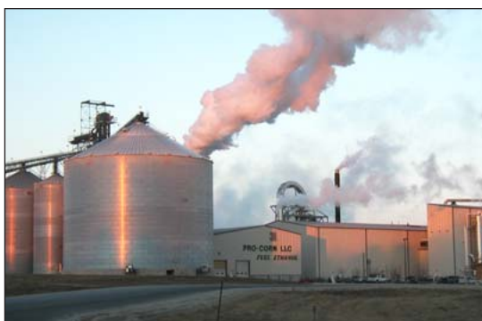
Ethanol plant.