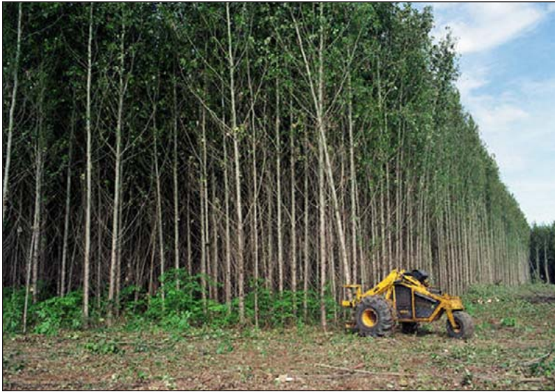
Poplar harvest.

The genetic engineering of crops raises concerns for farmers and the general public that include food safety concerns, herbicide resistance (the creation of “super weeds”), pesticide resistance, antibiotic resistance, harm to beneficial organisms, and loss of genetic diversity. There are also marketing and trade issues (since many countries refuse genetically modified products), liability issues, and a wide variety of food safety issues. For more discussion, see the ATTRA publication Genetic Engineering of Crop Plants .