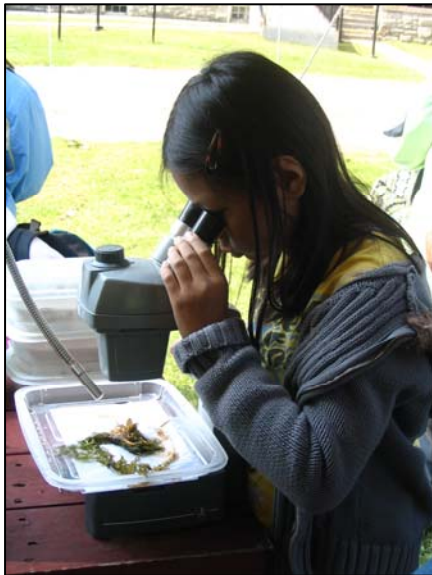
VIPs - Vermont Invasive Patrollers, protecting Vermont's waters from harmful invasive species through early detection

This Application Guide provides general information about financial assistance through the Grant-in-Aid Program and how to receive an application form. If you have additional questions or would like to talk to Program staff about your project and the Grant-in-Aid Program application requirements, refer to the contact information on the last page of this Guide.