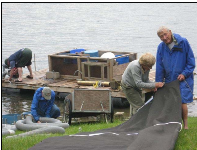
Lake Beebe Association members prepare the group's diver-operated suction harvester and fragment/silt curtain for the 2008 Eurasian watermilfoil management season. (Eva Brekenridge)

Once projects are approved and available funds allocated among eligible projects, award documents are developed and forwarded to the applicant for acceptance and signature. An initial payment for up to half of the total grant award will be issued after the Department of Environmental Conservation's acceptance of the signed award papers, the submittal of an invoice by the recipient, and after July 1, 2009.