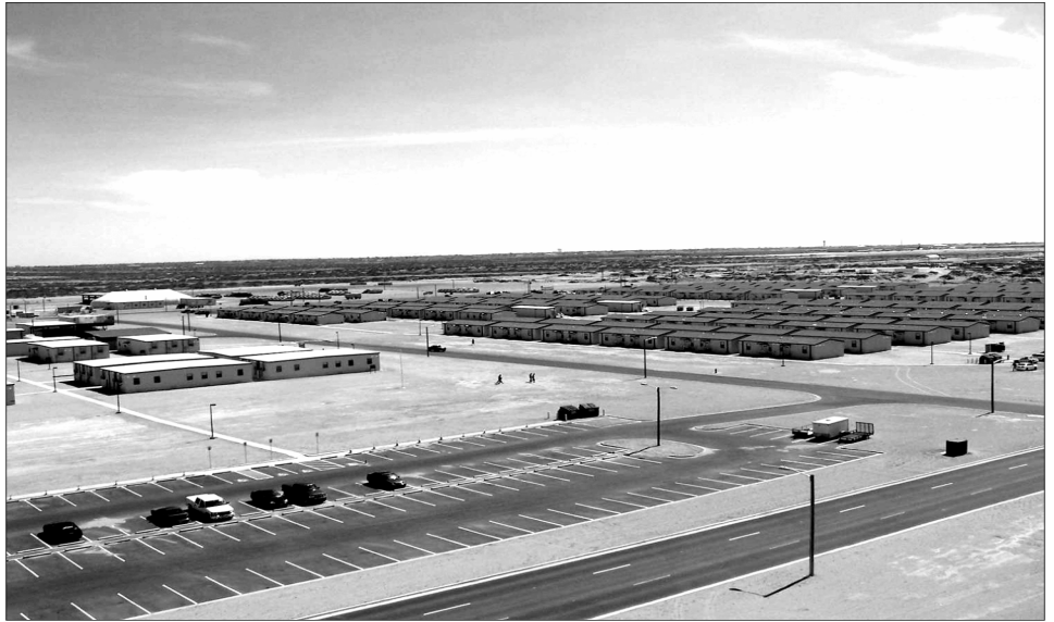
Figure 2: Panoramic View of Relocatable Buildings at Fort Bliss, Texas