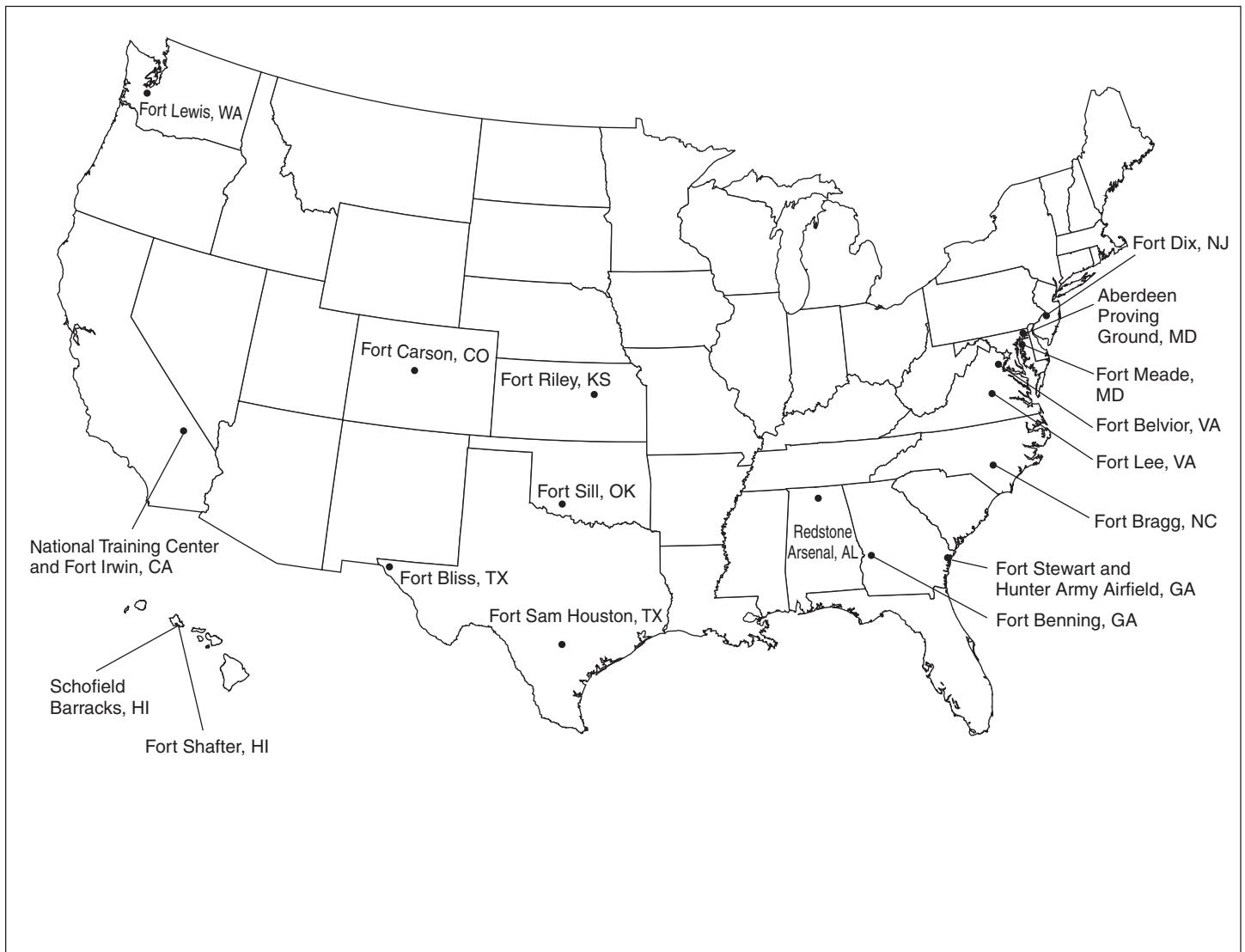
Figure 1: Locations of 18 Army Installations Expecting Net Gains of at Least 2,000 Personnel for Fiscal Years 2006 through 2011 Because of BRAC, Overseas Rebasing, Modularity, and Other Miscellaneous Restationing Actions

Sources: U.S. Army (data); Map Resources (map).