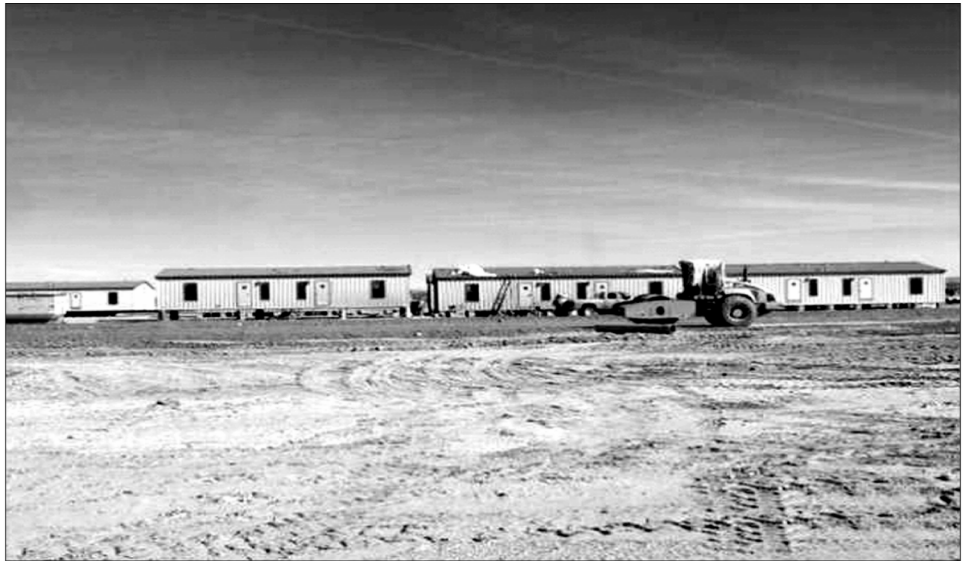
Figure 3: Closer View of Relocatable Buildings at Fort Bliss, Texas