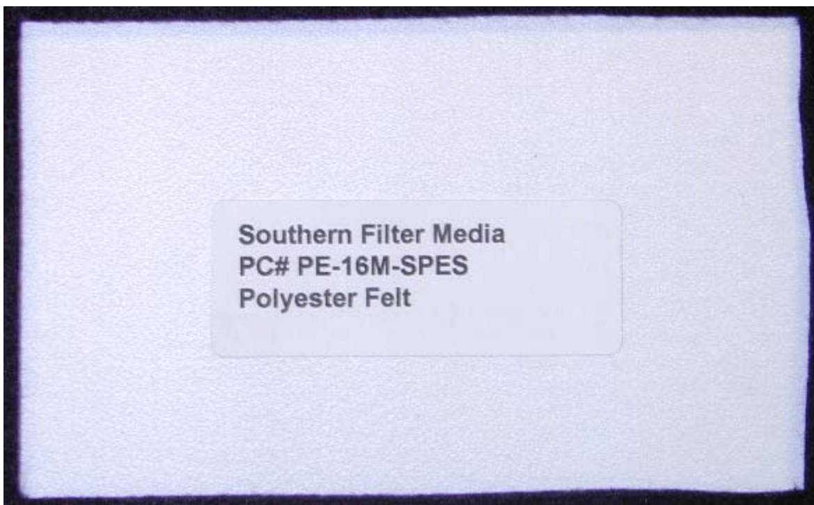
Figure 1. Photograph of Southern Filter Media, LLC's PE-16/M-SPES filter fabric