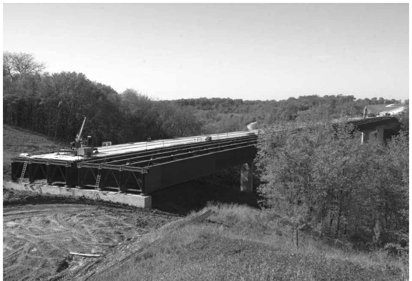
The Iowa River Bridge in Hardin County, IA, was assembled on one side of the river and rolled 496 m (1,630 ft) across the river valley into position.

The Colorado Department of Transportation's Transportation Expansion Project, or T-REX, also provided a vivid example of quality practices. The $1.67 billion multimodal project is improving 27 km (17 mi) of highway in the metropolitan Denver area, along with adding 30 km (19 mi) of light rail service. Its $1.2 billion design-build contract is the largest in the country and the first to encompass both highway and transit elements. Groundbreaking for the project began in September 2001, with completion scheduled for the end of 2006. Accelerated construction has been a hallmark of the project. "T-REX is sprinting into its final year 22 months ahead of the original estimated completion, thanks, in part, to performance specifications that give the contractor the latitude to innovate and improve,"