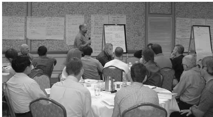
The first National Maintenance Quality Assurance Peer Exchange Conference offered participants a chance to compare best practices with others in their field.

Participants met in breakout sessions to discuss their top concerns and issues. These included developing a budget allocation model that is not only based on history, but also incorporates MQA data; determining how to use conditions and dollars spent to predict outcomes; developing meaningful and consistent performance measures for winter maintenance; integrating pavement management, maintenance management systems, and MQA; developing a set of frequently asked questions about