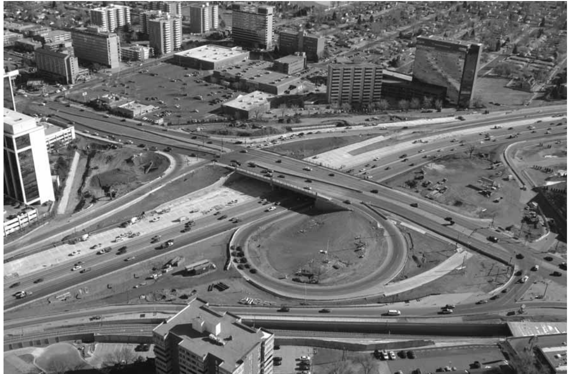
The T-REX project in Denver, CO, includes the reconstruction of 11 bridges spanning I-25. The Colorado Boulevard Bridge over I-25 was one of three bridges rebuilt in phases, so that traffic could be maintained on the structure at all times.