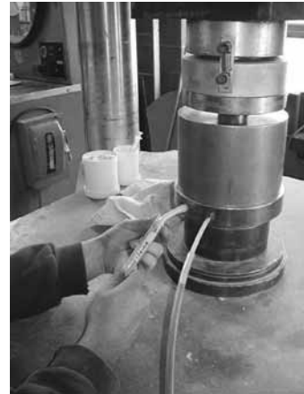
Pore water is extracted from a mortar sample as part of CPTP's research into incompatible concrete materials.