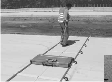
The MIT Scan-2 can be used to evaluate dowel bar placement in concrete pavements. The device rides on tracks as it is pulled across fresh or hardened concrete.