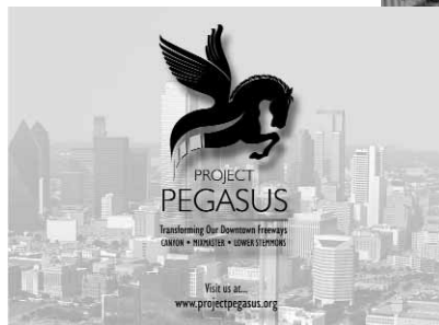
Project Pegasus will transform the two major Interstate freeways that serve downtown Dallas, IH 30 and IH 35E.