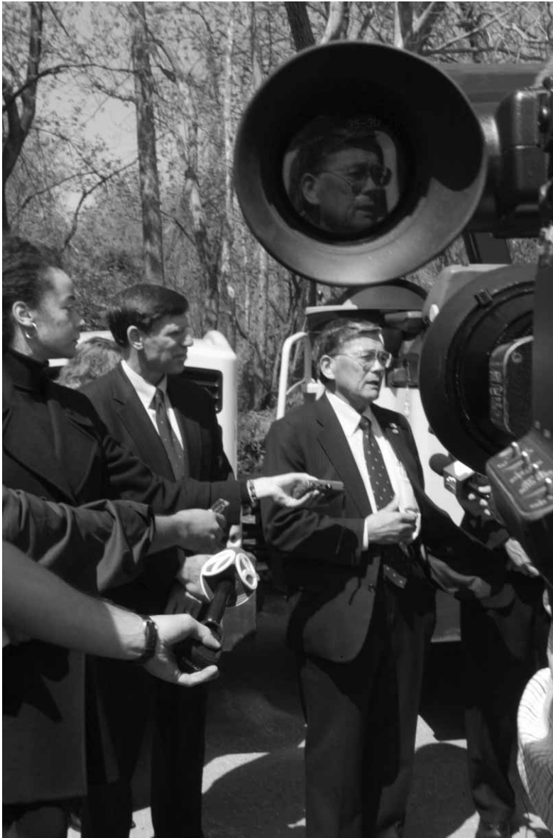
At a 2004 media event held at the construction site of the new Woodrow Wilson Bridge outside Washington, DC, U.S. Transportation Secretary Norman Y. Mineta highlighted Highways for LIFE's goals of achieving the long lasting, innovative, and fast construction of efficient and safe highway infrastructure.

improved constructibility, increased quality, and lower costs. More information on best practices for prefabricated bridge elements and systems and details on how these systems are being used around the country are available online at www.fhwa.dot.gov/bridge/prefab .