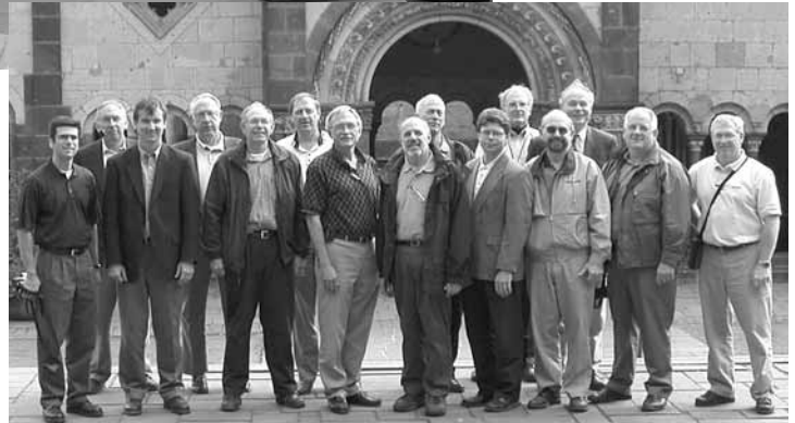
The scanning tour panel in Germany.

vation, and environmental impact. Denmark also considers the bidding of additional years of warranty as a best-value criterion. The host countries consider this best-value criteria to be critical to their warranty programs, as highway agencies must have greater confidence in contractors' ability to get the job done.