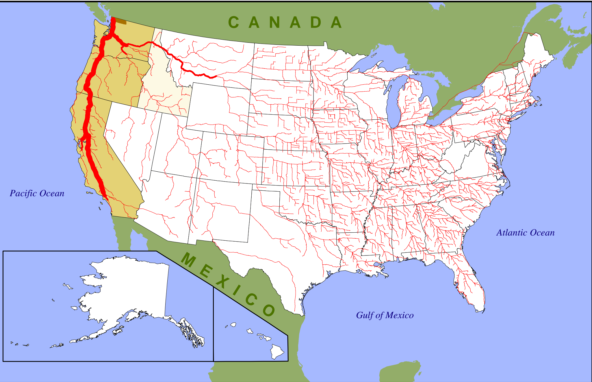
International Truck Flows for Border Crossings (1998)