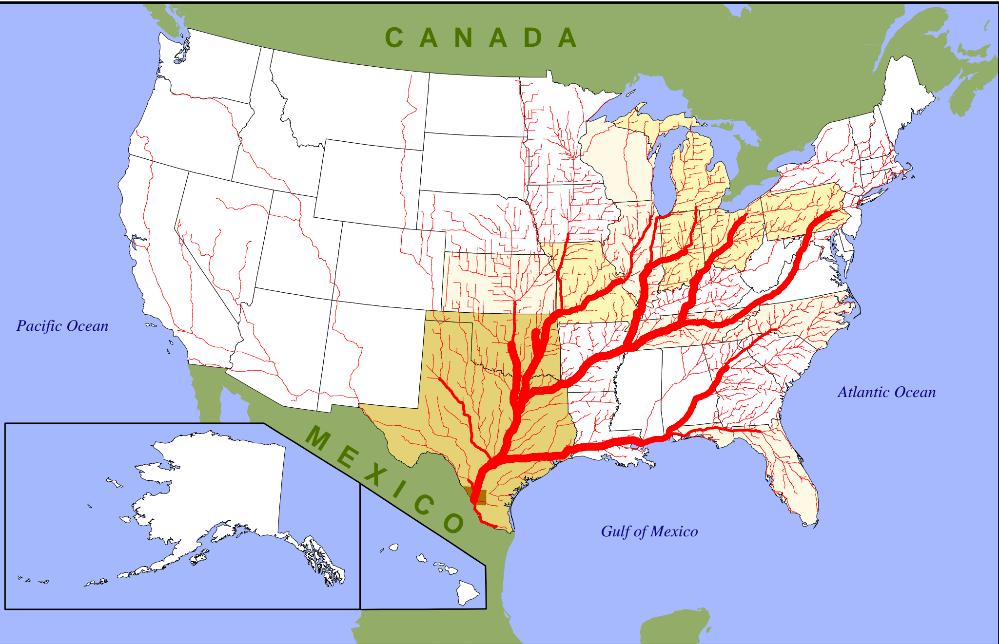
International Truck Flows for Border Crossings (1998)