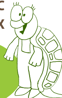
Shelley the Turtle

Shh... some of the words might be backwards or diagonal.