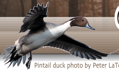
Pintail duck