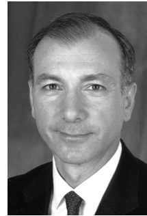
Steven A. Kandarian

We are also taking steps to address our situation and to rebuild the financial strength we