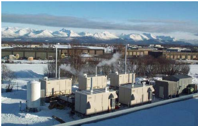
Large Fuel Cell Application

King County Wastewater Treatment Division in Renton, Washington, installed a 1 MW molten carbonate fuel cell power plant to reduce energy costs to the treatment plant. The output is tied to a transformer to step-up voltage to 13,000 V. The fuel cell system was chosen because of its high efficiency and low emissions. This cell is operated using methane from the anaerobic digesters. King County uses the electricity produced by the fuel cells to supplement its energy needs, which also reduces the facility's power costs by 15 percent. The estimated installed cost for the MCFC system was approximately $22.8 million, including the waste heat recovery system. The waste heat recovery unit for the exhaust is sized for 1.7 million Btu per hour of waste heat. At 45% electrical efficiency and at rated heat recovery, the net thermal efficiency of the plant is expected to be around 68%. The waste heat can also be returned to the digester loop.