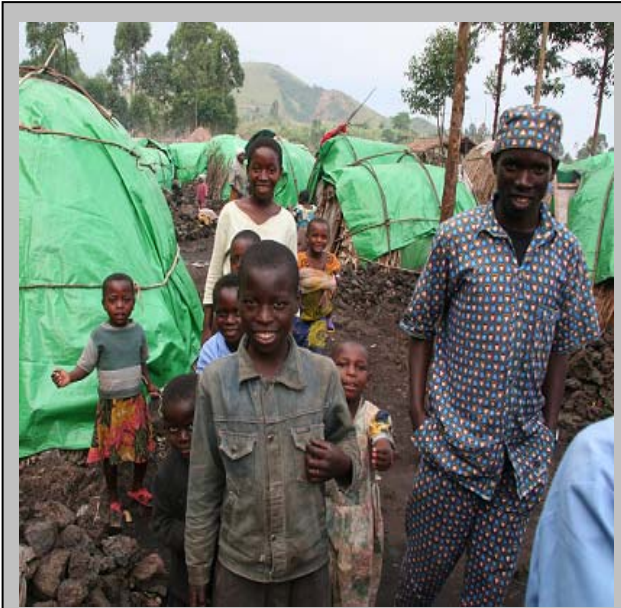
USAID/OFDA programs provide emergency relief supplies to thousands of conflict-affected IDPs in eastern DRC.

Since 1997, USAID has provided nearly $476 million in humanitarian assistance to the DRC, including nearly $224 million in relief commodities and emergency health, nutrition, agriculture, food security, economy and market systems, protection, coordination, road rehabilitation, and transportation interventions, and nearly $252 million in food aid to date.