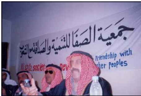
At a workshop in Anbar governorate, an Iraqi trained by ICSP discussed corruption and proposed measures the community could take to combat the problem.

USAID is building the capacity of local Iraqis to fight corruption in their own communities