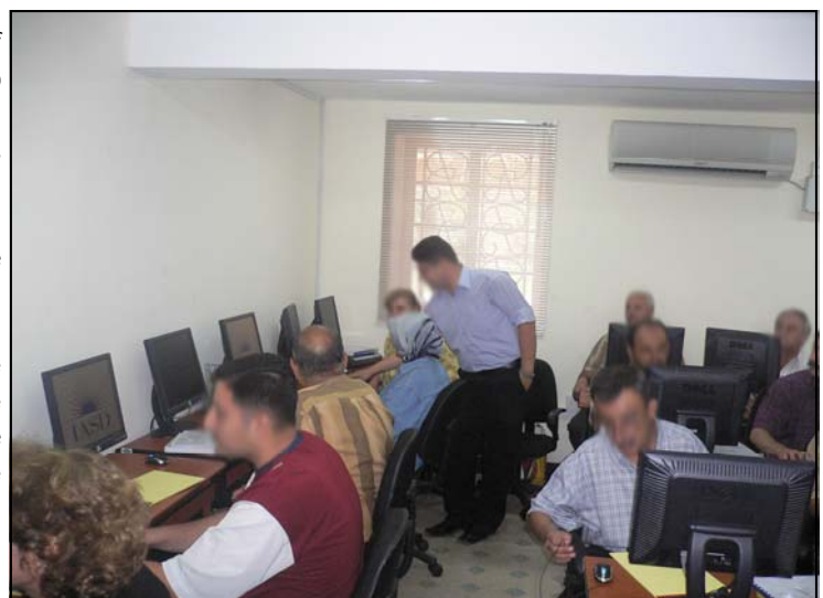
Over 50 Iraqi brokers are currently receiving training and technical support at the new IASD headquarters.

The training program is part of IASD's effort to prepare Iraqi brokerage companies for upcoming automated trading on the ISX. "This is the best training program I have attended" said one attendant. "We are truly grateful to the people who are contributing a great deal to see a real development in Iraq's capital markets".