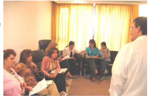
USAID's Izdihar project trains staff for the new Iraq Investment Promotion Agency.

The eight government workers from three Iraqi ministries received intensive training to become the first employees of the new Iraq Investment Promotion Agency, the independent organization created to encourage foreign direct investment in Iraq. The training, conducted by investment promotion experts, helped provide state-of-the-art tools to the new agency staff in order to assist them in marketing Iraq as a site for international investment. The Iraq Investment Promotion Agency is expected to play a leading role in job creation and economic development in Iraq.