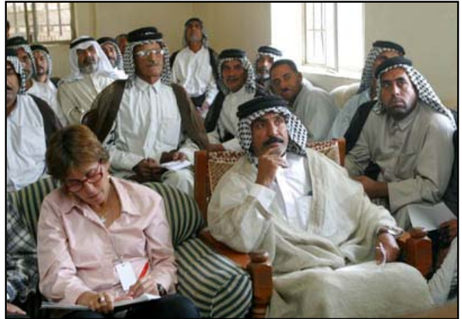
Mokhtars from Abu Ghrayek, one of 15 subdistricts of the Babil Governorate, listen to the basics of democracy and the selection process that will allow delegates to select 20 members from their communities to a new district council.