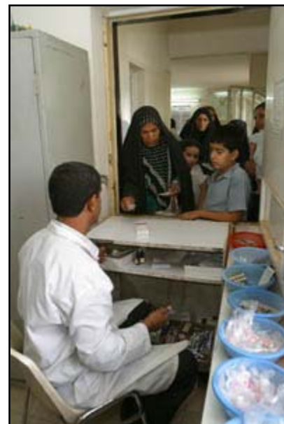
Iraqis receive medicine from a primary health care center in the Al-Kargh district of Baghdad, Iraq.