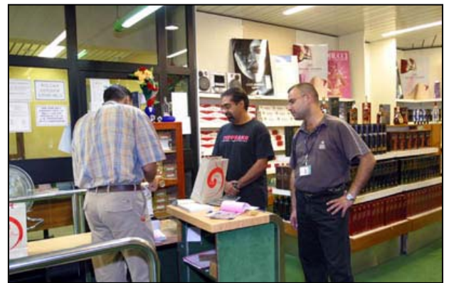
Shoppers at the duty-free store in Baghdad International Airport, which has been refurbished and repaired.

Bridges, Roads, and Railroads -- Objectives include: rehabilitating and repairing damaged transportation systems, especially the most economically critical networks.