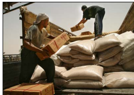
Workers load food supplies from a World Food Program warehouse in Umm Qasr, for distribution through local neighborhood agents. USAID supports the program which provides basic food rations to a large number of needy families in Southern Iraq.