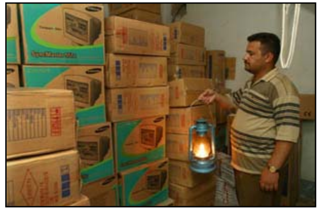
An employee of the Central Bank shows computers awaiting installation in the basement of the building. The computers are part of a USAID-funded "ministry in a box" program.