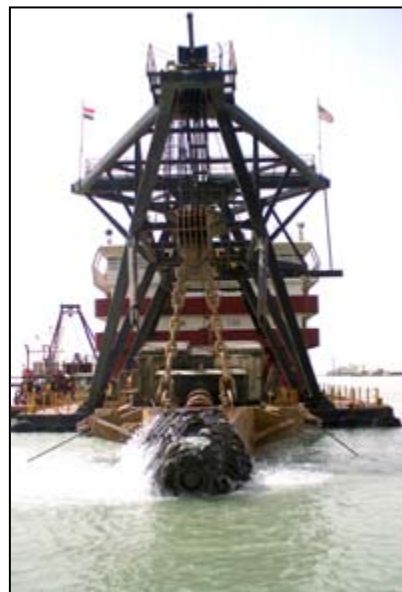
The Carolina lowers equipment to begin the emergency dredging of the Umm Qasr Port.

Telecommunications -- Objectives include: installing switches to restore service capability to 230,000 telephone lines in Baghdad area; repairing the nation's fiber optic network from north of Mosul through Baghdad and Nasiriyah to Umm Qasr by March 2004.