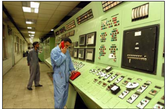
Iraqi engineers monitor controls at the Baghdad South power plant.