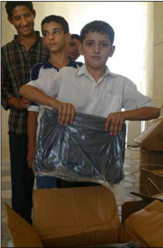
A student from the Zein Al Abdeen secondary boys' school in the Amil district of Baghdad receives his new school bag, which contains, pens, pencils, notebooks, a calculator, and other school supplies.