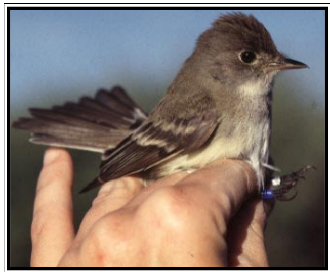
Figure 6-3. A color-banded southwestern willow flycatcher.

In some cases, willow flycatchers are faced with a situation that forces movement, such as when catastrophic habitat loss occurs. In 1996 and 1997, occupied flycatcher breeding habitat was destroyed by fire at two sites, one along the San Pedro River in Arizona (Paxton et al. 1996) and the other along the Gunnison River in southwestern Colorado (Owen and Sogge 1997). In Arizona, the willow-cottonwood habitat was completely burned during the breeding season as nesting was underway, destroying all or most of seven territories. At least four nests were lost, and all willow flycatchers abandoned the site within a week after the fire and were not seen again that year. No willow flycatchers attempted to breed in the burned area in 1997. Seven displaced flycatchers were resighted in 1997; two had moved to unburned areas within the breeding site, and five moved to other breeding areas