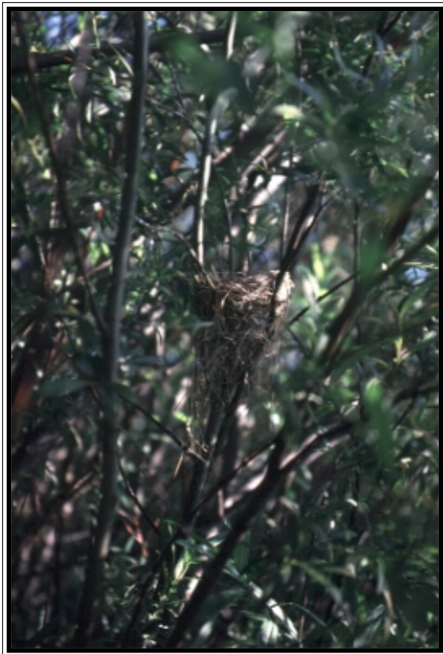
Figure 6-4. Willow flycatcher nest placed in a willow near Alpine, AZ.

Southwestern willow flycatchers build open cup nests constructed of leaves, grass, fibers, feathers, and animal hair; courser material is used in the nest base and body, and finer materials in the nest cup (Figure 6-4). Willow flycatcher nests sometimes