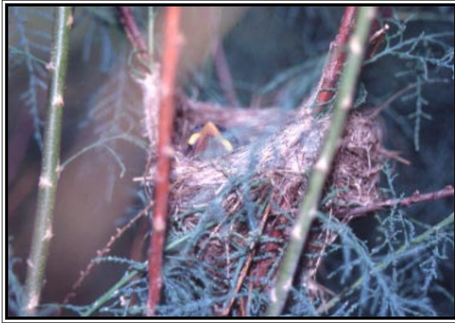
Figure 6-5. Southwestern willow flycatcher nest placed in tamarisk at Roosevelt Lake, AZ.

on the edge of the nest bush). For example, flycatchers sometimes nest >10 m high in native-dominated habitats along the San Luis Rey River, CA (W. Haas, unpublished data) and the Gila River, NM (Stoleson and Finch 1999). At such sites nest height is linked to the tree species that dominates the site.