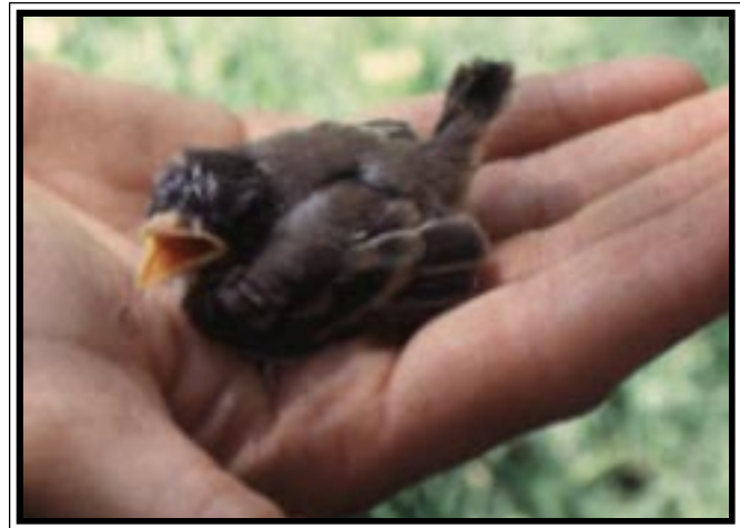
Figure 6-6. Nestling southwestern willow flycatcher. Note the yellow edge of bill and mouth lining.

Nestlings hatch out (on day 0) weighing only 2 g, mostly naked with only sparse gray down and the yolk sac still visible. Young hatch with the help of an egg tooth, which is no longer visible after the first week (King 1955, McCabe 1991). The edge of the bill and inside of the mouth of nestlings are bright yellow (Figure 6-6), as opposed to the orange mouth linings of brown-headed cowbirds (Tibbitts et al. 1994). Recently hatched flycatchers are unable to lift their head or move about, and motor coordination does not develop until days 2 or 3. Nestlings grow rapidly, reaching about 14 g by day 10. Feather development also occurs quickly, with most body and flight feathers