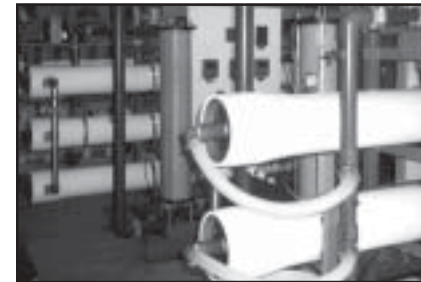
Centralized reverse osmosis treatment equipment

Reverse osmosis uses high pressure to force water through a membrane with microscopic holes, that prevents arsenic and other large contaminants from passing through. Some water is also not able to pass through the membrane and is wasted. Reverse osmosis can treat water containing up to 0.160 mg/L of arsenic. 1