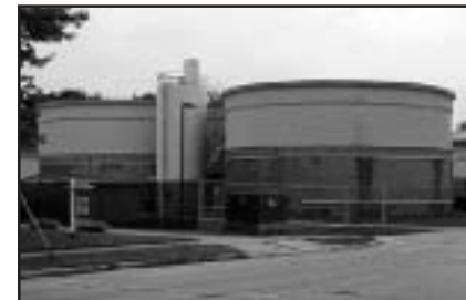
Lime softening treatment plant

The addition of lime to water causes calcium and magnesium to form solid particles, which can then be removed by clarification and filtration. Arsenic can join these particles and be removed along with them. Lime softening is very expensive and water systems are unlikely to install this technology only for arsenic removal. However, for water systems that use lime softening to reduce hardness, the process can be modified to increase arsenic removal. Modified lime softening can treat water containing up to 0.080 mg/L of arsenic. 1