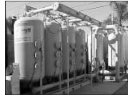
Activated alumina treatment plant

Activated alumina (AA), an adsorptive medium, uses very small grains, which are packed into a large container. Water is then continuously passed through one or more containers. When AA is exhausted it is simply disposed of and replaced with fresh AA. AA can treat water containing up to 0.160 mg/L of arsenic. 1