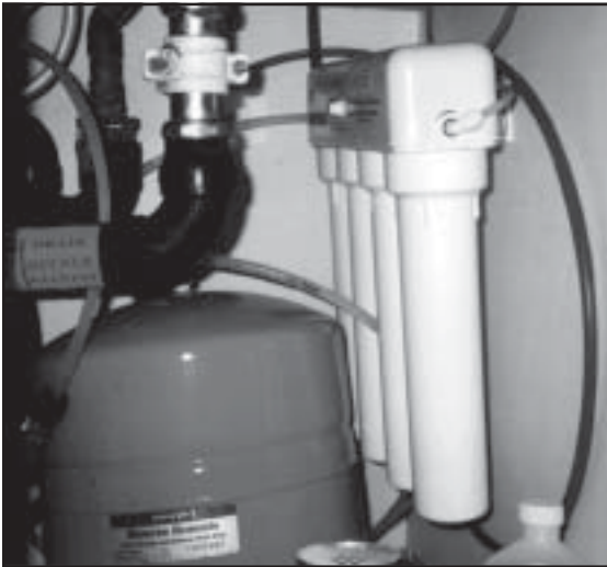
Point-of-use reverse osmosis treatment unit

Under the Arsenic Rule, systems have another approach available for achieving compliance. This approach involves system-installed and maintained POU devices on a single tap in each customer's household.