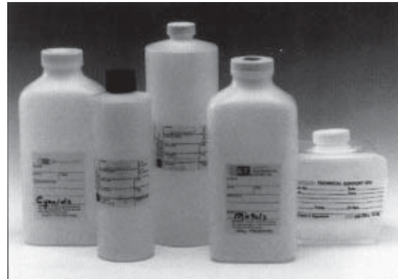
Typical inorganic contaminant sampling containers.

For example, the system described in the Arsenic Planning Worksheet monitored during the previous three compliance periods (i.e., in 1998, 2001, and 2004). The system also collected samples from each sampling point and analyzed them using approved analytical methods. Since all of the results were below 0.010 mg/L, this system may be eligible for a waiver. Note that, in 1992, the system used analytical method SM 3120B. This method is not approved for compliance with the revised MCL, so the data from 1992 could not be used to satisfy the waiver eligibility requirements. In addition, the system did not sample from each sampling point in 1995. Therefore, these data do not meet the waiver requirements.