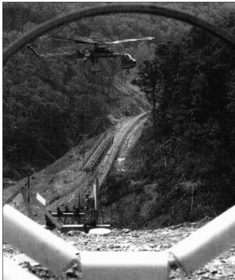
Technology aids every phase of the mining process. Here, a helicopter assists in constructing a coal conveyor system.