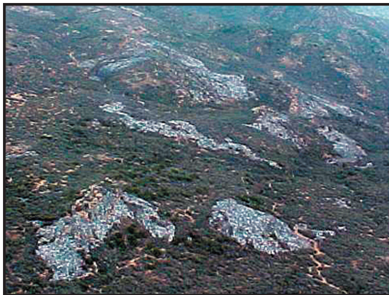
Example of the mosaic patterns within the burn block.

Project. Developed with the assistance of the Arizona State Land Department and in cooperation with private landowners, the burn is one piece of a 14,000-acre fuels treatment project selected for the President's "Healthy Forest Initiative." It is intended to increase firefighter and public safety through reduction of hazardous fuels, preventing the occurrence of a catastrophic wildfire.