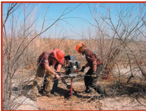
Workers drilling holes for pole plantings.

The largest treatments are in progress right now. From February to April, 50,000 trees will be planted to replace those lost in the fire and to stop the establishment of salt cedar. The species planted are cottonwood, willow, mesquite, and three shrubs common to the Lower Colorado River. Complementing the tree planting effort, the burned area is also receiving a seed treatment. Four species of salt tolerant and fire resistant shrubs have been selected for seeding. The next steps in the project are to prepare the plantings for the heat of a