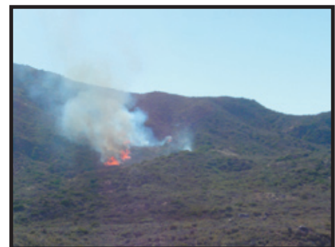
Helitorch commences firing. The Weaver Mountain Prescribed burn begins.

Phoenix-Kingman Zone Fire and Fuels crews completed a 1,000 acre prescribed burn in early December 2003 as part of the Weaver Mountain