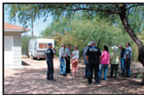
BLM employees meet with concerned homeowners regarding hazardous fuels around their homes.

BLM fire staff met with community leaders and concerned homeowners last summer in St. David, Arizona to discuss firebreaks recommended in the recently completed community wildfire hazard assessment and mitigation plan. One of the landowners wanted permission from the BLM to reduce hazardous fuels adjacent to their home, located only 20 feet from public land.