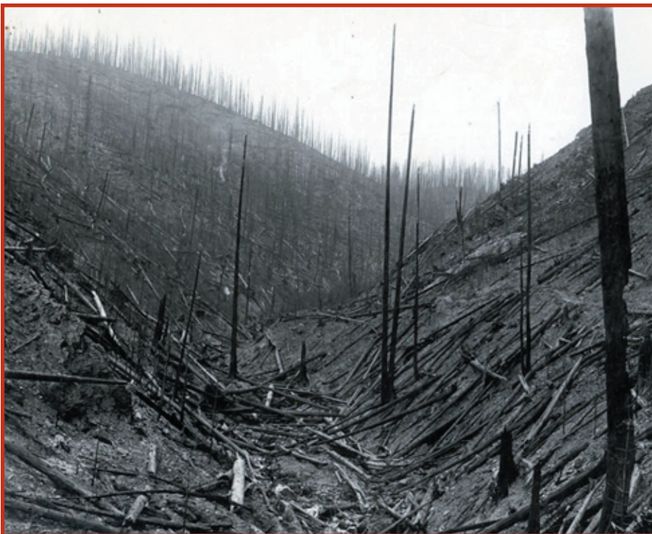
In 1910, almost half of the city of Wallace was burned over by a wildfire that struck the city from Placer Creek, a drainage located south of the city. The devastating aftermath has not been erased from the memories of people living in the area.