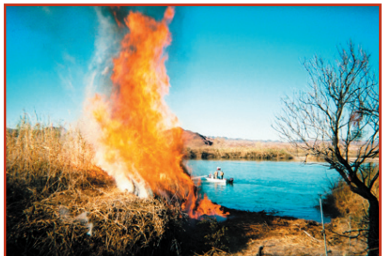
Prescribed fire in use to protect endangered Clapper Rail.

The burns are designed to create a positive benefit by utilizing fire as a substitute disturbance mechanism in place of regular flooding. At this point, regular floods no longer remove decadent buildup in cattail and bulrush marshes, which are the preferred habitat of the Yuma Clapper Rail. The burns also had a side benefit of breaking up the continuity of hazardous fuels within the Havasu and Imperial National Wildlife Refuges, thus making suppression effort along the lower Colorado River more effective.