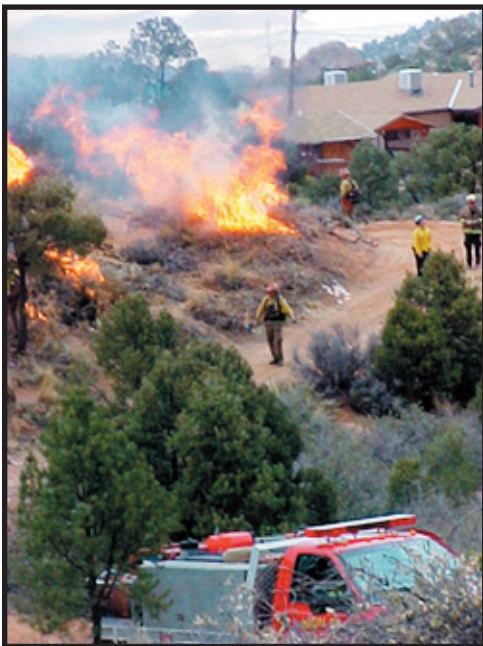
Creating defensible space along the west side of Pinion Pine. BLM firefighters burning along the fuel break.