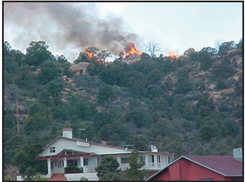
After the fuel break was constructed, brush piles were burned. Several of the piles were near homes in Pinion Pine.

So far fully one-third of the three mile fuel break has been completed. As BLM fuels crews continue to make progress, residents are also working to reduce hazard fuels on private property, making homes safer from wildfire. Once the fuel break is complete and homeowners have improved their properties, residents will rest easier knowing that collaboration, cooperation and citizen-driven solutions have helped