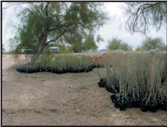
Some of the 50,000 trees to be planted replacing those lost in the Mittery Lake Fire.

may become established in the area disturbed by the wildfire.