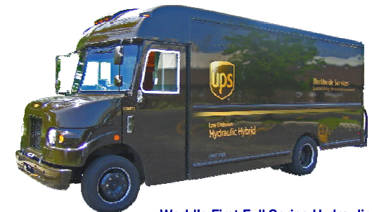
World's First Full Series Hydraulic Hybrid Delivery Vehicle Prototyped in a UPS "Package Car"