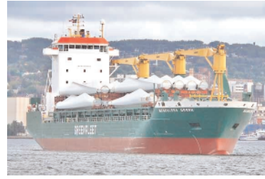
Siemens 2.3 mega watt wind cargo destined for Mower County MN recently arrived into the Twin Ports.