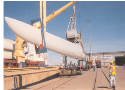
Wind turbine cargo handled by Lake Superior Warehousing Stevedores at the Twin Ports.