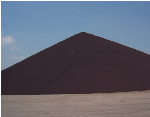
Giant mound of iron ore being held at Midwest Terminals of Toledo International Inc., bound for China.

The Toledo Lucas County Port Authority has partnered with the Strategic Education and Economic Development Corporation (SEED) a newly established, non-profit corporation that will provide its members with a bilingual sales and marketing presence in China. SEED will offer in-country services ranging from travel arrangements and local office support to market research and import and