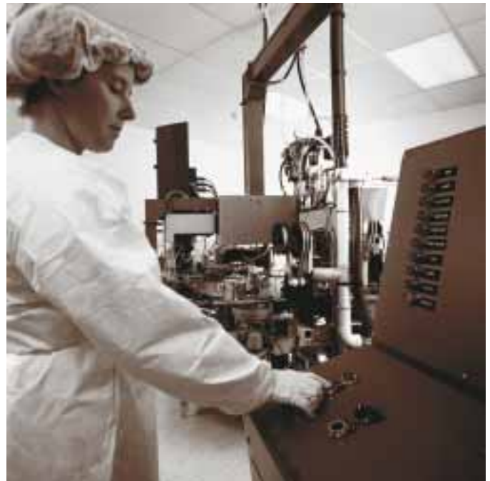
Employment, earnings, and job outlook depend on repairers' area of expertise. Other precision instrument and equipment repairers are the largest group and have the highest earnings, but employment is expected to decline.

Precision instrument and equipment repairers need different skills and training, depending on their specialty. However, some general qualifications usually are required. For example, repairers must pay attention to detail, enjoy solving problems and disassembling machines to see how they work, and be able