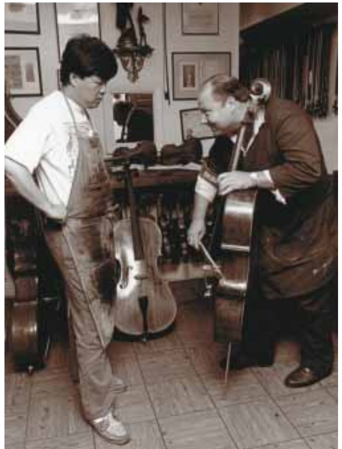
Most musical instrument repairers and tuners have some posthigh school training. Some begin learning their trade on the job as assistants.

Other precision instrument and equipment repairers must