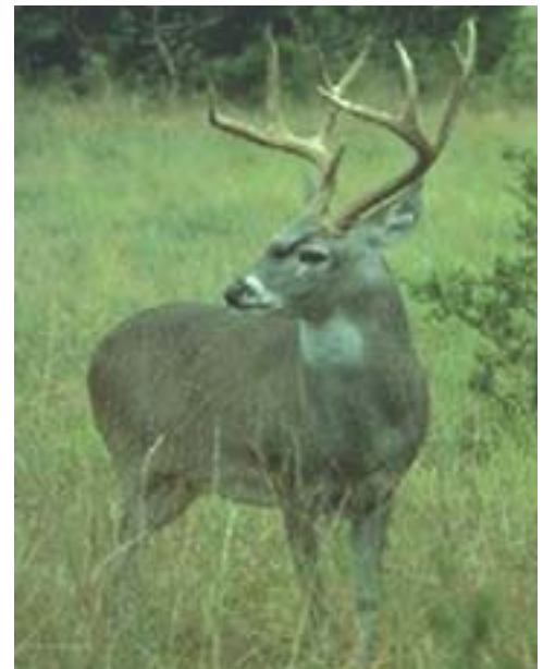
White-tailed deer.

For additional information on this disease, please try some of the following websites: