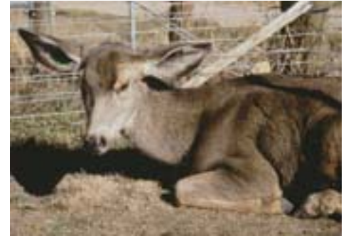
Infected mule deer.

Chronic Wasting Disease (CWD) affects elk, white-tailed deer and mule deer, but is not known in livestock or humans. No treatment is known and the disease is fatal.