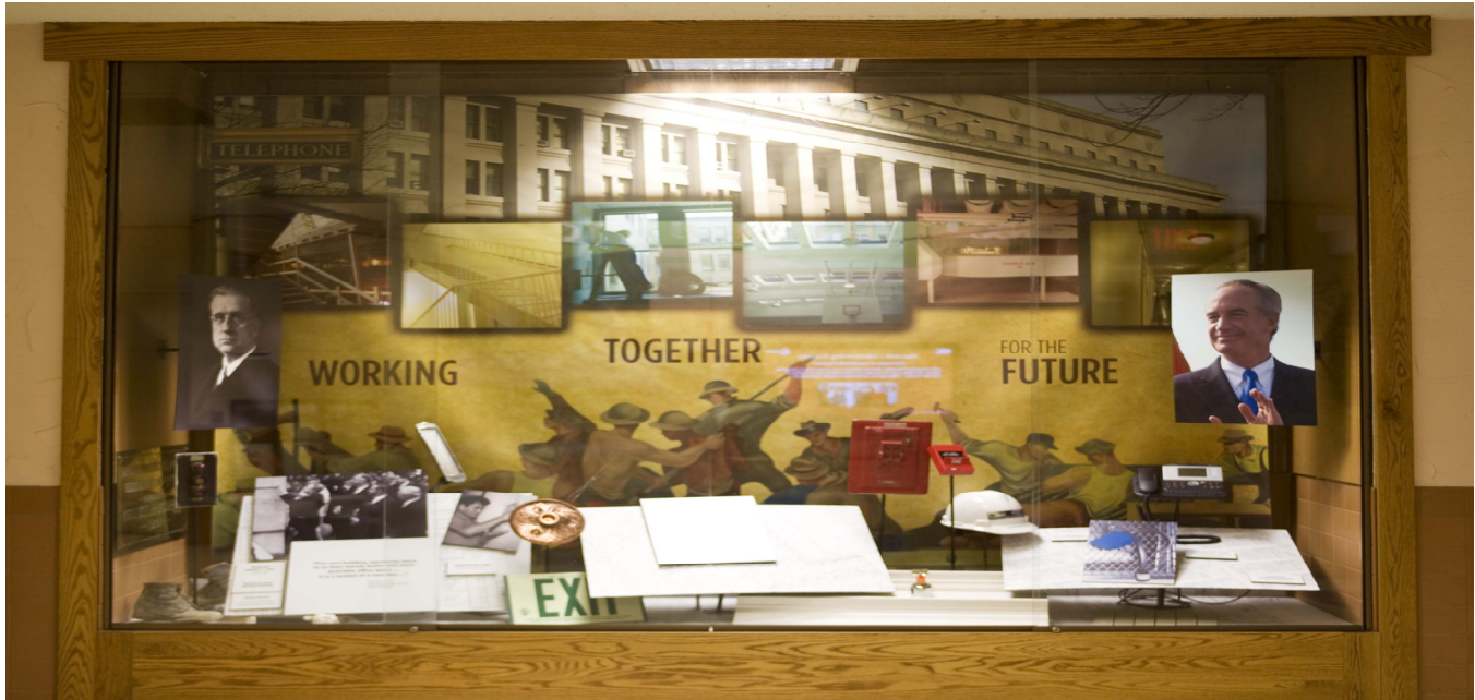
Modernization Exhibit located in Main Interior Building Cafeteria