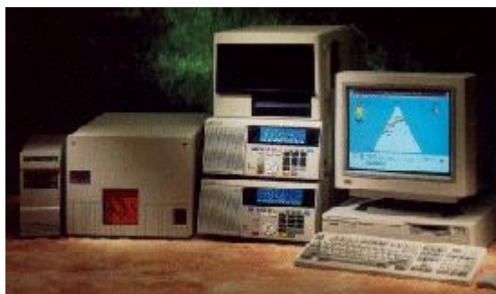
Figure 3-16. Perkin-Elmer Turbo LC Plus HPLC System