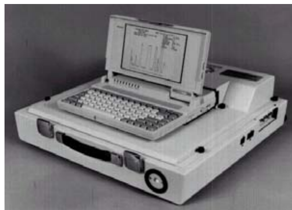
Figure 3-14. Sentex Systems, Incorporated Scentograph Plus II