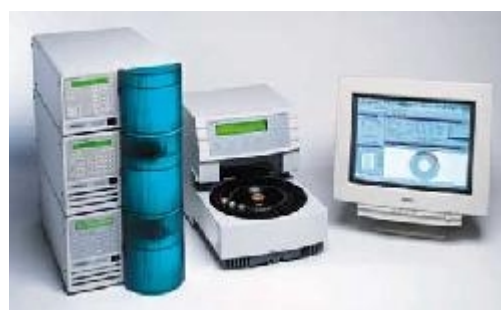
Figure 3-18. Varian ProStar Analytical HPLC System