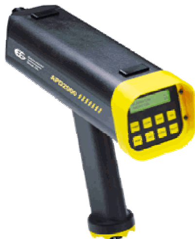
Figure 3-1. APD 2000 Environmental Technologies Group, Incorporated

The M8A1 Automatic Chemical Agent Alarm System is another example of an IMS technology chemical agent detection and warning system. It incorporates the M43A1 detector to detect the presence of nerve agent vapors or inhalable aerosols. The M43A1 detector is an ionization product diffusion/ion mobility type detector. Air is continuously drawn through the internal sensor by a pump at a rate of approximately 1.2 L/min. Air and agent molecules are first drawn past a radioactive source ( ^{241}\text{Am} ), and a small percentage are ionized by the beta rays. The air and agent ions are then drawn through the baffle sections of the cell. The lighter air ions diffuse to the walls and are neutralized more quickly than the heavier agent ions that have more momentum and are able to pass through the baffled section. As a result, the collector senses a greater ion current when nerve agents are present compared to the current when only clean air is sampled. An electronic module monitors the current produced by the sensor and triggers the alarm when a critical threshold of current is reached.