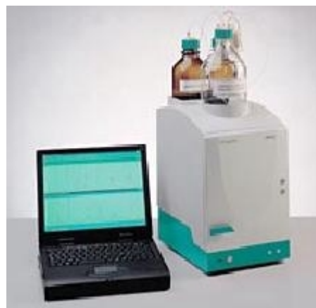
Figure 3-20. Brinkmann Metrohm Model 1761 IC System