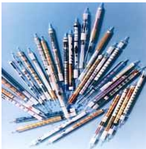
Figure 3-5. Draeger Tubes

Detector kits, or tickets, are wet chemistry techniques formulated to indicate the presence or absence of a chemical agent by a color change resulting from a chemical reaction involving the suspect agent. These kits are usually used to verify the presence of a chemical agent after an alarm is received from another monitor. The kits are also used to test drinking water for contamination. A similar detection method using this technology is detection paper, which contains a dye that is colorless when crystalline and colored when dissolved in a chemical agent. Detector papers are generally used for testing suspect droplets or liquids on a surface. For gaseous or vaporous chemical agents, colorimetric tubes are also available. These consist of a glass tube that has the reacting compound sealed inside. Upon use, the tips of the tubes are broken off and a pump is used to draw the sample across the reacting compound (through the tube). If a chemical agent is present, a reaction resulting in a color change takes place in the tube. Draeger manufactures a number of colorimetric tubes. A picture of the Draeger colorimetric tubes is shown in Figure 3.5.