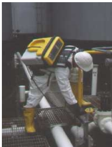
Figure 3-11. Inficon Hapsite® Field Portable System