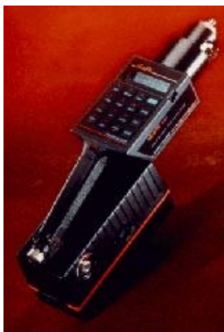
Figure 3-10. Perkin-Elmer MicroFID Handheld Detector

for the nonspecific determination of flammable and potentially hazardous compounds in the concentration range of 0.1 to 50,000 ppm. The MicroFID is shown in Figure 3-10.