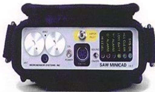
Figure 3-6. SAW Minicad II

pattern for the target vapor. When the response pattern for the target vapor matches the stored pattern, the system alarm is activated. The selectivity and sensitivity of these detectors depends on the ability of the film to absorb only the suspect chemical agents from the sample air. Many SAW devices use preconcentration tubes to reduce environmental interferences and increase the detection sensitivity. A detector manufactured by Microsensor Systems, Incorporated that is based upon the SAW technology is the SAW Minicad II (Figure 3-6).