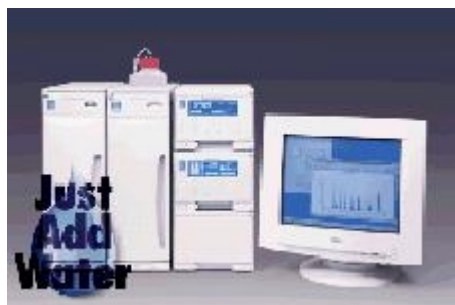
Figure 3-19. Dionex DX-500 IC System

Like HPLC, IC instruments can use uV-Vis spectrometers, mass spectrometers, and electrochemical detectors.