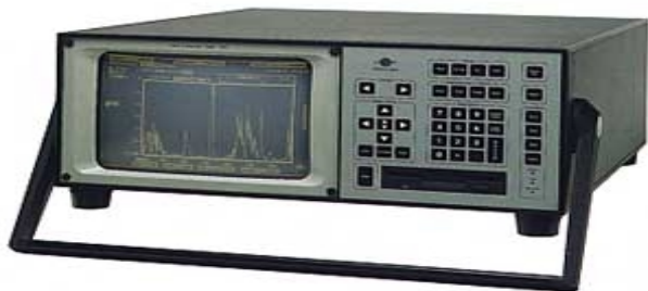
Figure 3-2. Innova Type 1301 Multigas Monitor