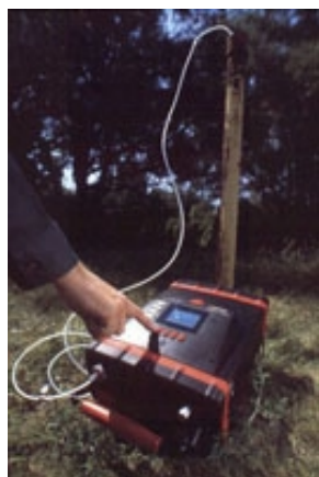
Figure 3-13. Perkin-Elmer Voyager

The gas chromatograph uses an inert gas to transport a sample of air through a long chromatographic column. Each molecule sticks to the column with a different amount of force and does not travel down the column at the same speed as the carrier gas. This causes the chemical agents and interferants to come out the end of the column at different times (called the retention time). Since the retention time is known for the chemical agents, the signal from an associated detector is only observed for a short period starting before and ending just after the retention time of the chemical agent. This eliminates false alarms from similar compounds that have different retention times. Using a pre-concentrator specific to the analyte can also reduce false alarms caused by interferants. The pre-concentrator passes air through an absorbent filter that traps agent molecules. The filter is then isolated from the air and heated to release any chemical agent that may have been trapped. The released chemical agent is then pumped through the column and the detector. Two instruments that use gas chromatography are the Perkin-Elmer Voyager and the Sentex Systems, Incorporated Scentograph Plus II shown in Figures 3-13 and 3-14 respectively.