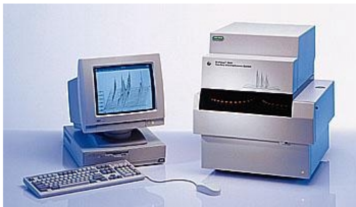
Figure 3-23. Bio-Rad BioFocus 2000 CZE System