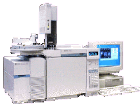
Figure 3-12. Agilent 6890-5973 GC/MSD