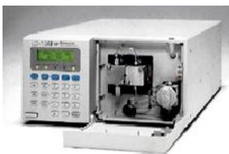
Figure 3-17. Shimadzu LC-10 HPLC System