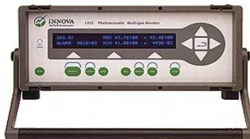
Figure 3-3. Innova Type 1312 Multigas Monitor