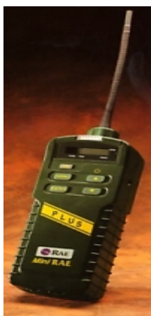
Figure 3-7. MINIRAE Plus

Photo ionization detectors work by exposing a gas stream to an ultraviolet light of a wavelength with energy sufficient to ionize an agent molecule. If agents are present in the gas stream, they are ionized. An ion detector then registers a voltage proportional to the number of ions produced in the gas sample and thus the concentration of the agent. Specificity of these detectors is a function of how narrow the spectral range of the exciting radiation is and on how unique that energy is to ionizing only the molecule of interest. Rae Systems produces the MINIRAE Plus, a handheld detector that utilizes the PID technology. Another handheld PID detector is the Photovac 2020 manufactured by Perkin-Elmer. These detectors are shown in Figures 3-7 and 3-8.