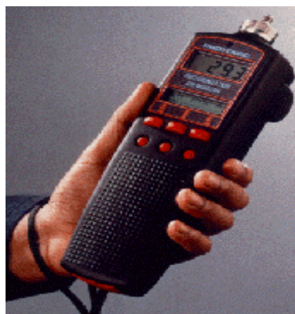
Figure 3-8. Photovac 2020 PID Monitor