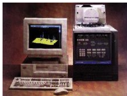
Figure 3-22. Beckman-Coulter P/ACE TM 5000 CZE System