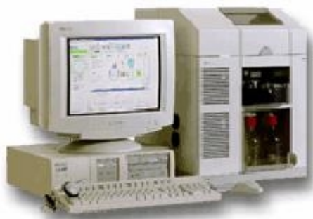
Figure 3-21. Hewlett-Packard HP 3D CZE System

Hewlett Packard manufactures the model HP 3D CZE System, Beckman-Coulter manufactures the model P/ACE TM 5000 CZE System, and Bio-Rad manufactures the BioFocus 2000 CZE System. CZE instruments are typically configured with either a uV-Vis spectrometer or an electrochemical detector, but it can be interfaced to a mass spectrometer. Capillary zone electrophoresis instrumentation shares the same electrical requirements as HPLC and IC instruments. However, the need for high purity water and chemical reagents is still there but in much smaller quantities. These systems are shown in Figures 3-21, 3-22, and 3-23.