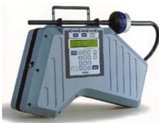
Figure 3-4. Miran SaphIRe Portable Ambient Air Analyzer

The filter based infrared spectrometry technology is based upon a series of lenses and mirrors that directs a narrow bandpass infrared beam in a preselected path through the sample. The amount of energy absorbed by the sample is measured and stored in memory. The same sample is examined at as many as four additional wavelengths. This multiwavelength, multicomponent data is analyzed by the microprocessor utilizing linear matrix algebra. Concentrations of each component, in each sample, at each station, are used for compiling time weighted average (TWA) reports and trend displays. The DMCS retains data for further analysis and longer term storage and retrieval. The Foxboro Company produces two of these detectors: (1) the Miran SaphIRe, a portable ambient air analyzer, and (2) the Miran 981B, a multipoint ambient air monitoring system. The Miran SaphIRe is shown in Figure 3-4.