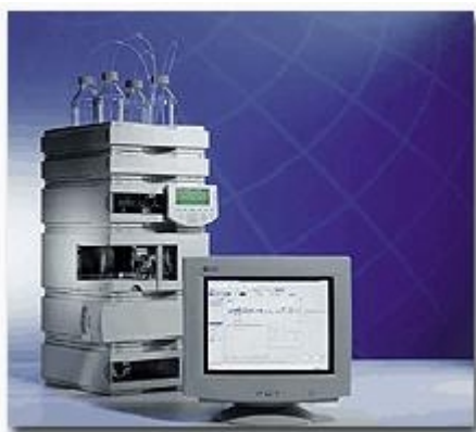
Figure 3-15. Hewlett Packard HP1000 HPLC System

High performance liquid chromatography is most useful in the detection and identification of larger molecular weight chemical agents such as BZ or LSD, and in the detection and identification of biological agents. With HPLC, those compounds that do not easily volatilize can be analyzed without undergoing chemical derivatization. HPLC instrumentation is available from a variety of vendors such as Hewlett Packard, Perkin-Elmer, Shimadzu, and Varian, and is shown in Figures 3-15, 3-16, 3-17, and 3-18. As with GCs, HPLC instruments can be equipped with a variety of detectors such as ultraviolet-visible (uV-Vis) spectrometers, mass spectrometers, fluorescence spectrometers, and electrochemical detectors. Two limitations to the fielding of HPLCs and their detectors are the need for power requirements (120V house current) and high purity solvents. Currently there is no portable HPLC unit available.