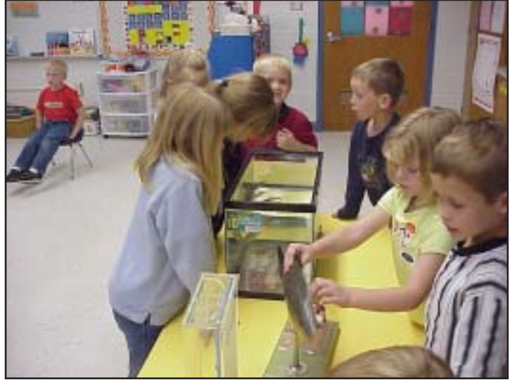
-USFWS Photos Elementary students check out an aquarium full of fish during a presentation by LaCrosse Fish Health Center May 14.

Numerous posters, fish models and a paddlefish mount were available for the students to observe during and after the presentation. But the most popular display was an aquarium containing a small lake sturgeon, a channel catfish, a largemouth bass and a rainbow trout. At the end of the presentation, each student received a copy of the Fishing ABC's coloring book. Kenneth Phillips, LaCrosse FHC