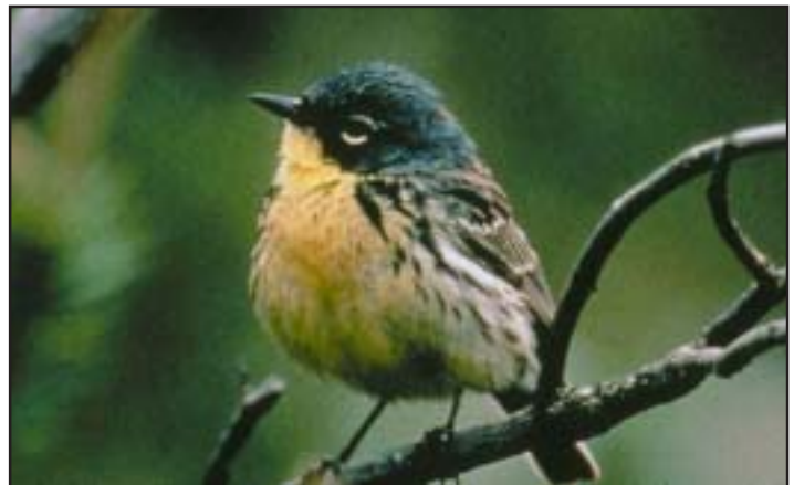
A male Kirtland's warbler.

The meeting was also critical in helping coordinate 2003 Kirtland's warbler census activities in the U.P. Sites where warblers have been located in the recent past are key areas to census. The group also wanted to expand from known warbler locations to potentially "new" habitat. An effort to map other suitably aged jack pine stands for future census efforts has begun as a result of this meeting. Christie Deloria, U.P. ES sub-office