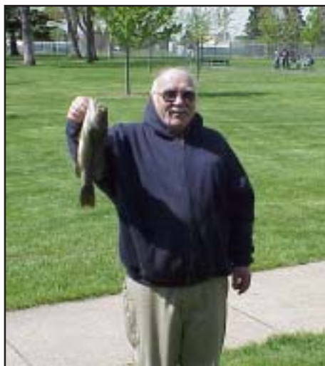
A successful angler shows off the bass he snagged during the VA fishing tourney.

Angling is a popular activity that provides Tomah VA clients with many hours of therapeutic outdoor recreational opportuni-