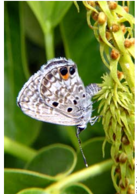
Miami blue butterfly, a species that is a candidate for listing as endangered.

Because of the number of candidates and the time required to list a species, we developed a priority system designed to direct our efforts toward the plants and animals in the greatest need. In our priority system, the degree or magnitude of threat