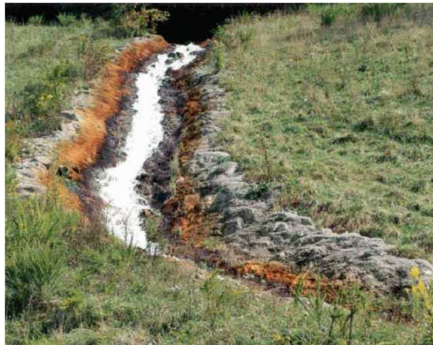
Untreated acid mine drainage in the Cheat River Watershed.