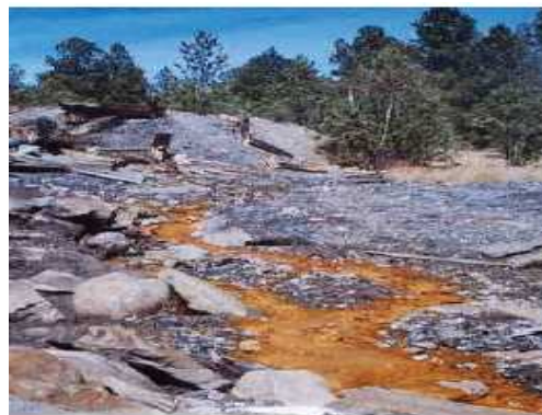
Acid mine drainage at Minnesota Ridge, Black Hills, South Dakota.

Former mine lands continue to cause water quality problems because they are a major source of heavy metal pollutants. Mining often requires deforestation