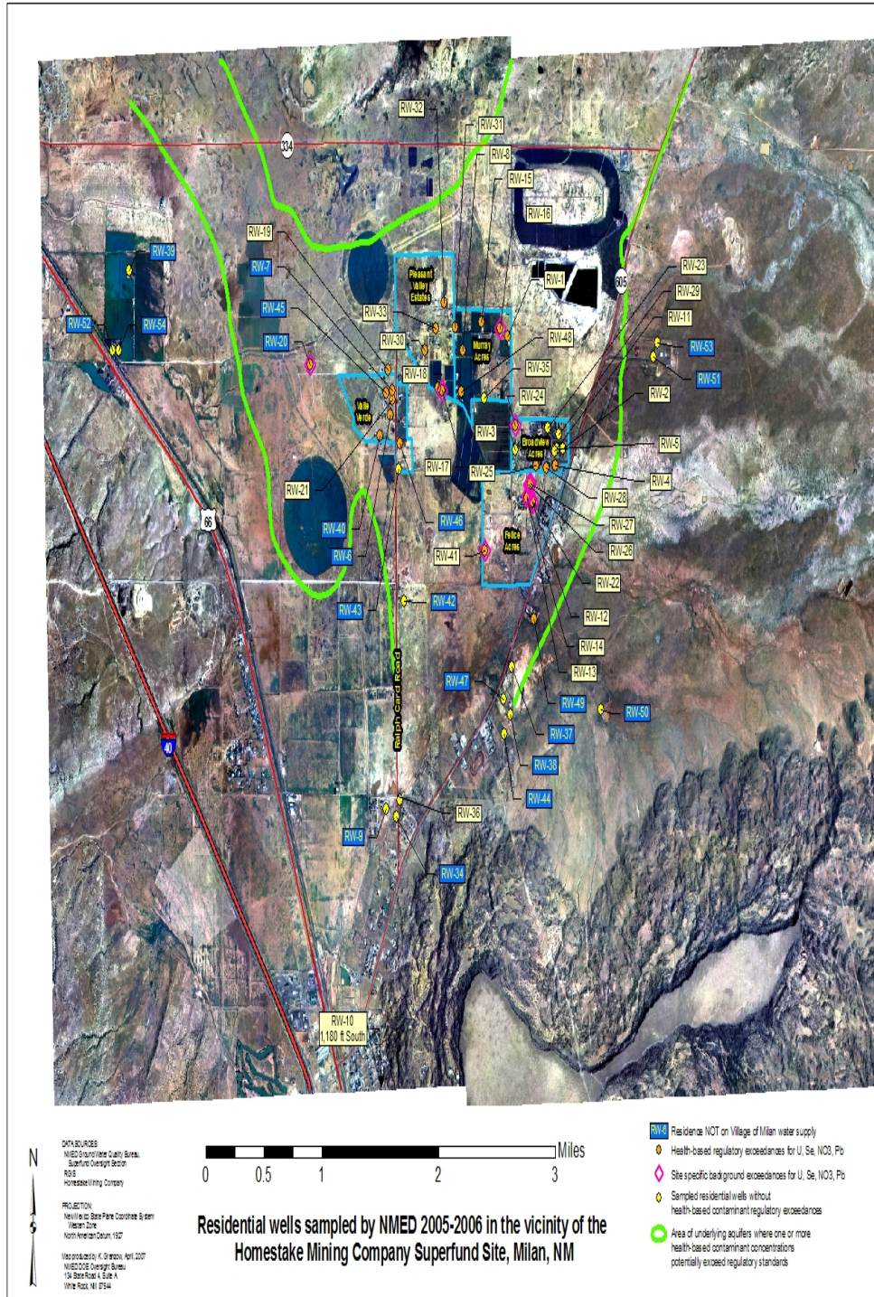
Figure 1. Locations of wells sampled in September 2005 and May 2006