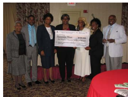
EPA staff present check to representatives from Harambee House and the Woodville and Hudson Hill neighborhoods.