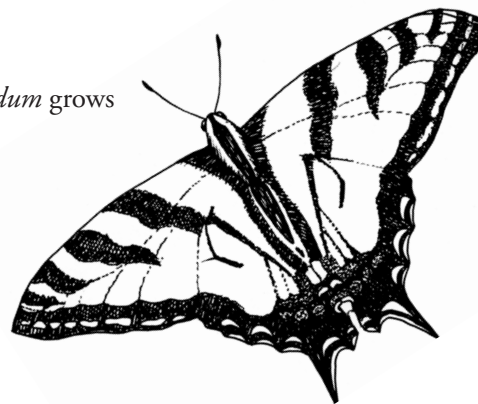
Western Tiger Swallowtail (2.5 - 3.5")

Clodius Parnassian, Parnassius clodius claudians : common in a variety of habitats Olympic Parnassian, Parnassius smintheus olympiannus : high elevations where Sedum grows Anise Swallowtail, Papilio zelicaon zelicaon : very common in most habitats Western Tiger Swallowtail, Papilio rutulus : very common in most habitats Pale Tiger Swallowtail, Papilio eurymedon : not as common as other swallowtails