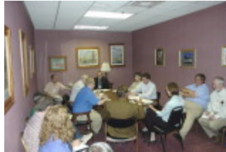
Technical Issues Committee