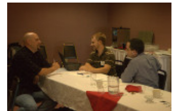
Website committee meeting during break-out session