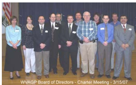
WVAGP Board of Directors