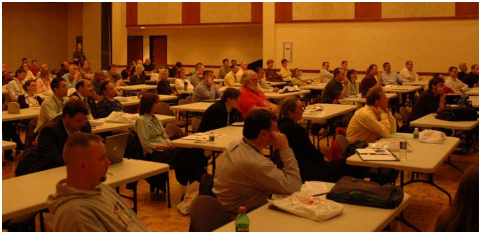
WV GIS Conference in May 2006 in which the new coordinating body was presented to prospective members.