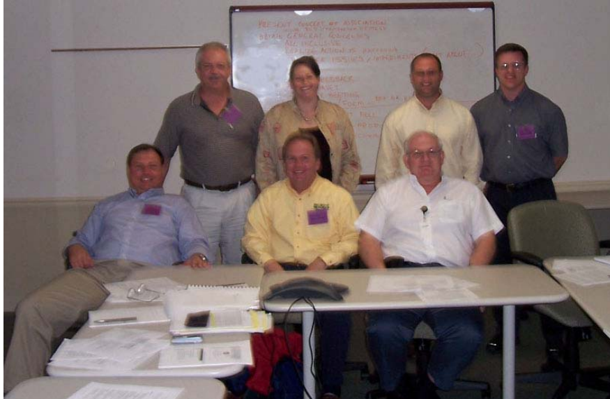
WV GIS Coordination Committee meeting in May 2006