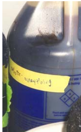
"Waste—everything" is improper labeling and an accident waiting to happen.