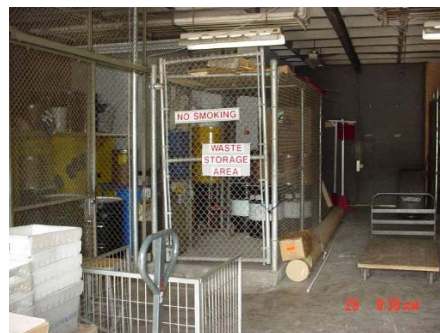
A clearly marked, secure waste storage area in an out of the way location.