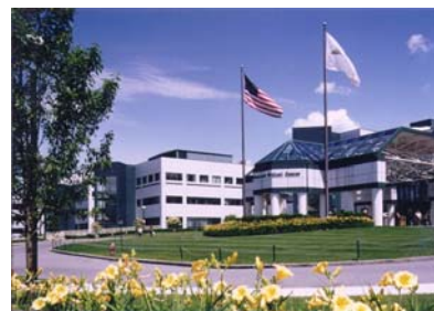
Dartmouth-Hitchcock Medical Center, New Hampshire.

The safety and well-being of others is paramount to a well-managed medical facility. However, in providing quality health care, hospitals and other health care facilities use large quantities of materials and generate large quantities of diverse waste, portions of which are hazardous. The generation of these wastes has an impact on the communities the hospitals serve and subjects hospitals to regulatory requirements. EPA is helping educate health care facilities about their regulatory requirements and ways to reduce the negative impact of their operations. By reducing hazardous and non-hazardous wastes, thousands of hospitals across the country are demonstrating that small measures can go a long way. The money saved in disposal fees can be reinvested in patient care and the environment also benefits.