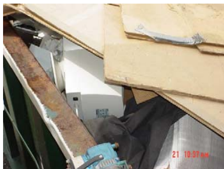
Can you spot the waste management mistake? It's the computer monitor (hazardous waste) mixed in with solid waste in the dumpster.

amount of solid waste. Learning the difference between these two types of waste and implementing simple procedures to separate them from generation to disposal can greatly reduce costs. Hazardous and regulated medical waste disposal costs about 30 cents per pound for disposal compared to 4 cents per pound for non-hazardous waste.