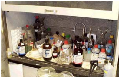
Lab hood with improper chemical storage.