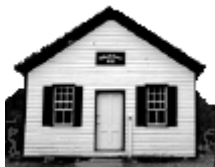
24 Schoolhouse Built at Millbrook in 1840 as a church. Relocated here c. 1860 for use as a school.

Old Mine Road (paved/auto traffic) south to Watergate, Depew, & Interstate 80