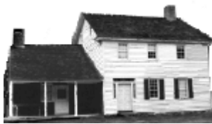
17 Van Campen Farmhouse Built c. 1800 Moved here 1970s