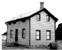
20 Garis House Built here c. 1850