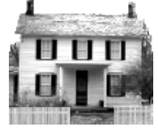
3 Trauger House Built here c. 1860