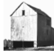
4 Trauger barn