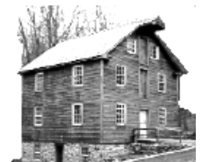
10 Grist Mill Built here in 1990s on site of Abram Garis' 1832 mill.

north to Peters Valley & Dingmans Bridge Old Mine Road