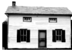
12 Hill House Built here c. 1850s

Old Mine Road (paved/auto traffic) south to Watergate, Depew, & Interstate 80