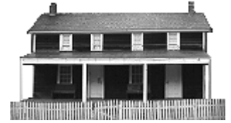
5 Hotel (boarding house) Built here c. 1850