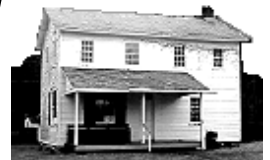
9 General Store Moved here 1973 to site of earlier store.