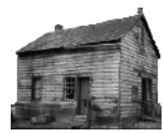
1 Spangenburg cabin Built here c. 1900