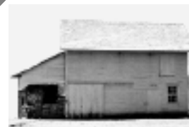
23 Garis barn