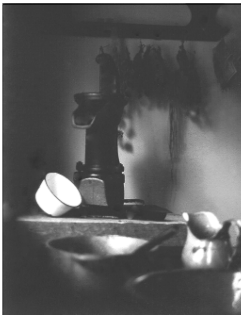
Still life at Garis House.