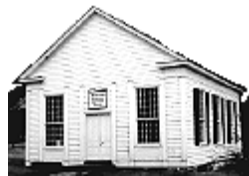
11 Methodist Episcopal Church Reconstructed here in 1973 to plans of 1860 church that was built on this site.