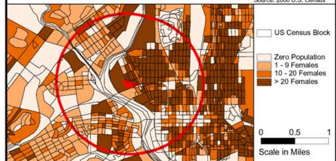
Figure 5: Site Demographic Maps