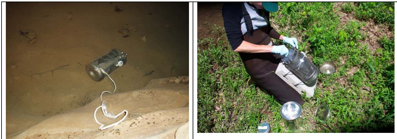
Figure 2. Deployment of a stainless steel canister in a cave (left) and at one of the surface sites (right).