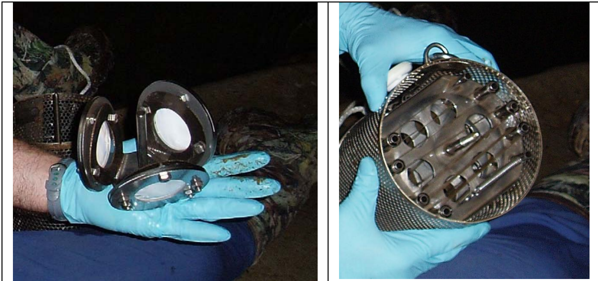
Figure 1. POCIS (left) and SPMD (right) sampling membranes deployed at the cave and surface water sites.