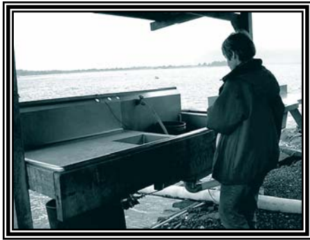
Fish Cleaning Station