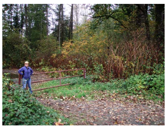
Before and after photos of SE 114<sup>th</sup> Levy

Washington State owns the remaining five. Table 2 below summarizes the results of knotweed treatment by property owner, describing the gross infested area and the net area