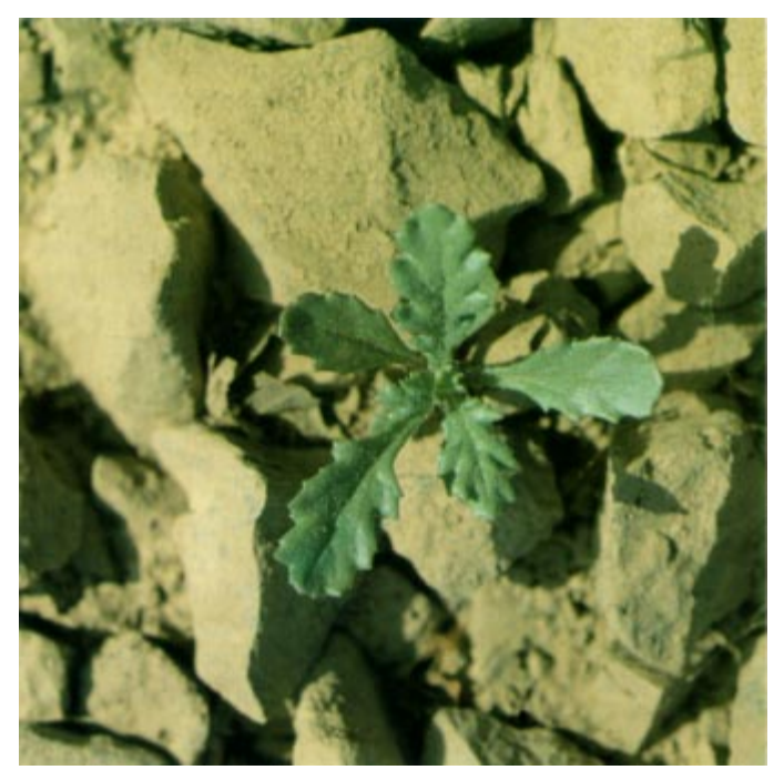
Figure 3.— A seedling plant of common groundsel.

For suggested herbicides in different cropping situations, refer to the Pacific Northwest Weed Control Handbook , an