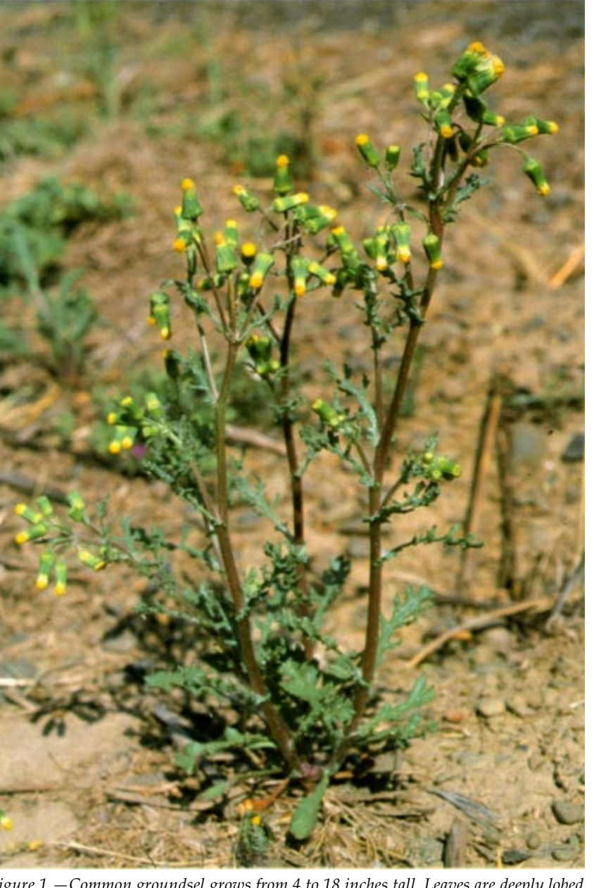
Figure 1.—Common groundsel grows from 4 to 18 inches tall. Leaves are deeply lobed with toothed margins. The lower stems and undersides of basal leaves usually are purplish-colored.

Susan Aldrich-Markham, Extension agent, Yamhill County, Oregon State University.