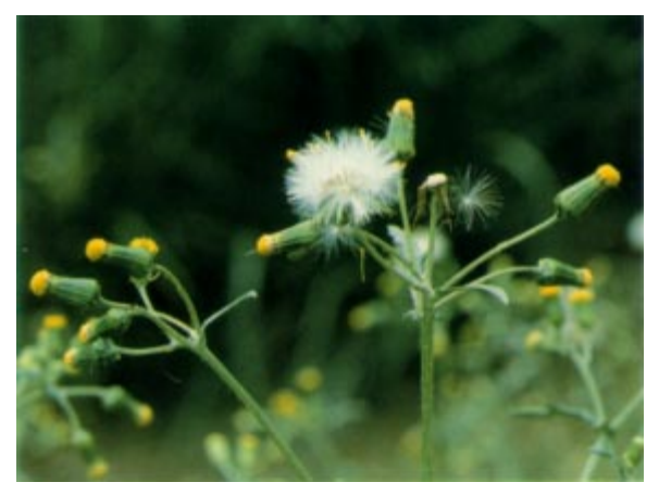
Figure 2.—The flower heads are ^{1/4} to ^{1/2} inch long, with yellow disk flowers and black-tipped bracts around the base. Seeds are carried on the wind by a tuft of silky white hairs.

have the same mode of action in the same field year after year.