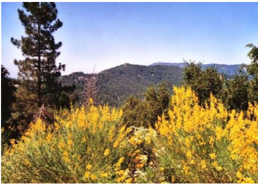
Mature Spanish broom becomes very dense and is considered a fire hazard during the dry season.