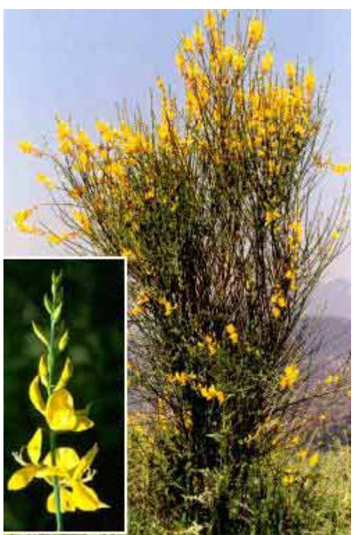
Due to its limited distribution in King County, Spanish broom is a Class A weed; removal is required by law.

King County Noxious Weed Control Program Line: 206-296-0290 www.kingcounty.gov/weeds