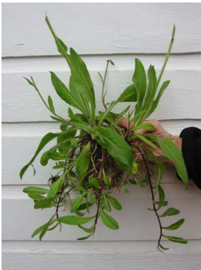
Care should be taken to remove the entire plant when hand-pulling.

Manual: Dig up plants in the spring or early summer when the soil is still moist and before the seeds mature. Plants can re-sprout from creeping stolons and rhizomes so care should