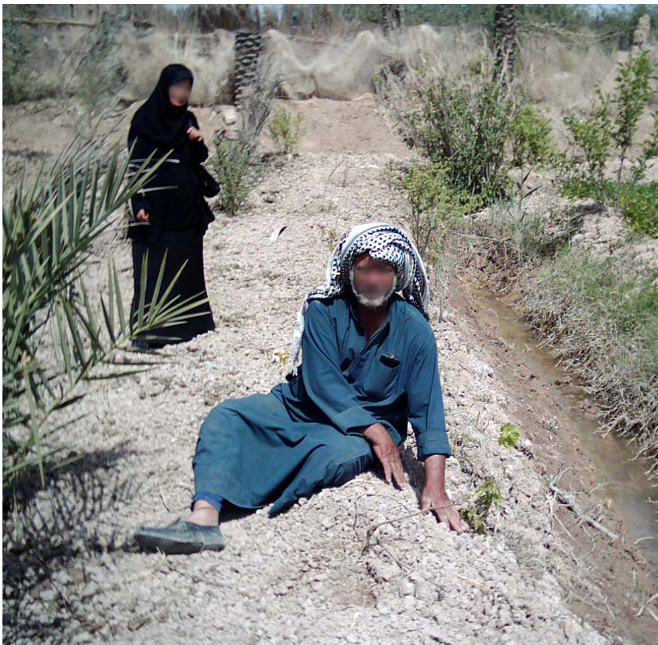
Farmer in Basrah.