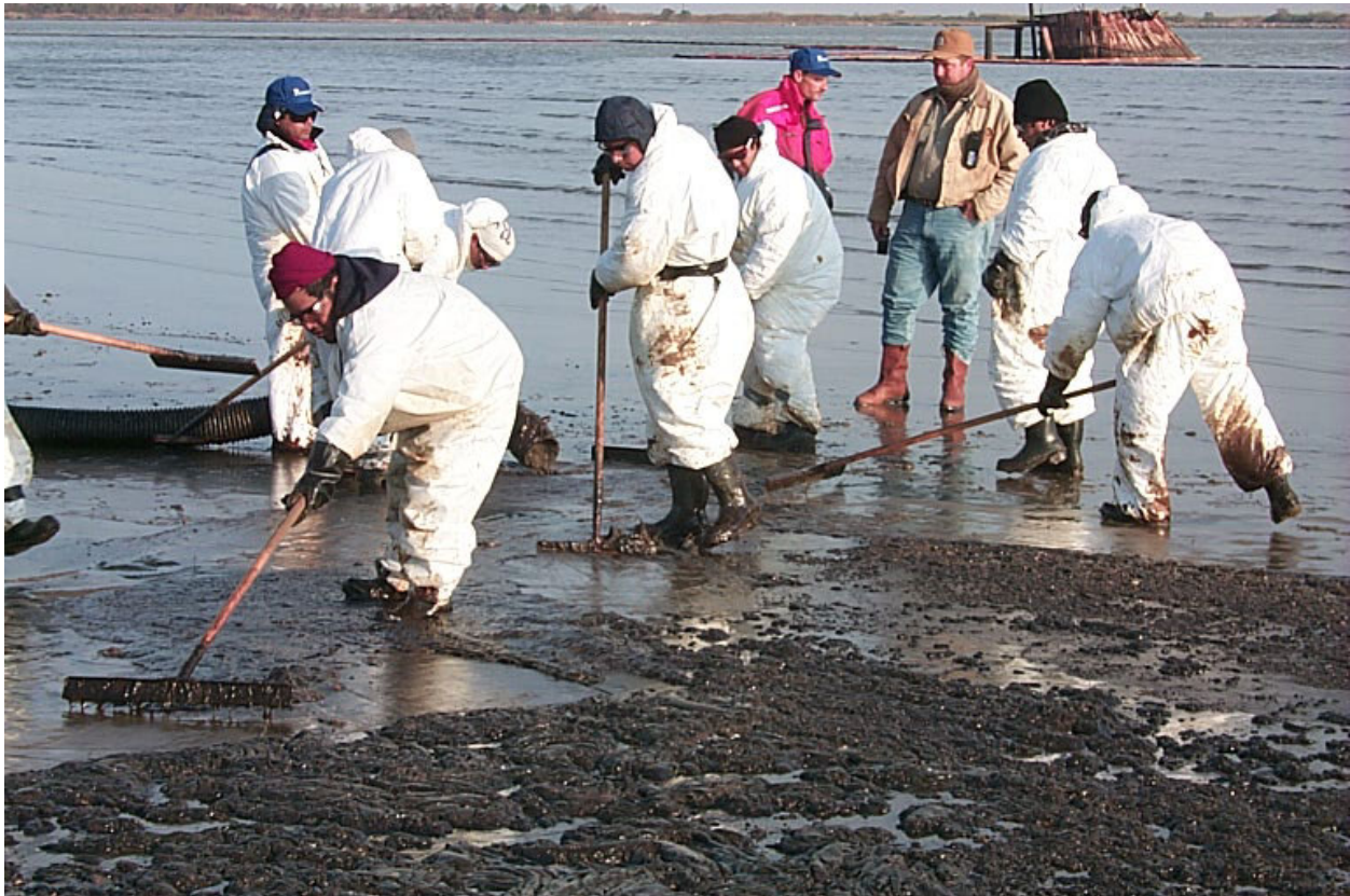
Figure 3. Cleanup of the viscous oil early in the morning when it was below the pour point.

The oil had a high paraffin content and a low asphaltene content. When spilled, the oil did not spread as thin film or sheen as is typical for a light crude oil (see Fig. 1). On cool mornings, the temperature was below the pour point of the oil, causing the oil to have the consistency of margarine. Figure 3 shows cleanup workers using squeegees to push the oil into piles for recovery. The oil readily formed an emulsion; three samples collected within the first few days contained 32, 43, and 63 percent water by weight. The spilled oil was not in the ADIOS database, but distillation data were obtained and used to run the ADIOS2 model.