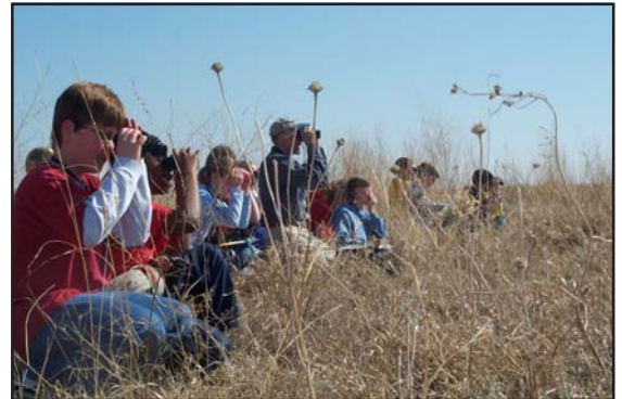
Students in the Prairie Science Class study in the outdoor classroom of the Prairie Wetlands Learning Center.

Also, since the PWLC houses employees including a Park Ranger, Environmental Education Specialist, Instructional Systems Specialist, and two middle school teachers, the expansion will improve the tools available not only to students but also to the professionals who are the backbone of the learning center.