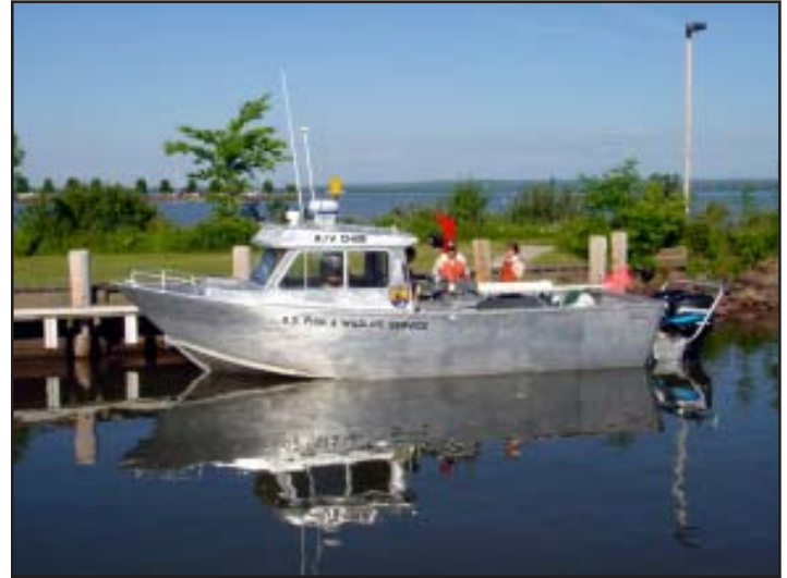
The new R/V Chub alongside the dock in Ashland. The 2000 Consent Decree requires Ashland to do certain surveys, for which they needed a research vessel. The Chub's builder grew up on Lake Superior and knew the conditions the Chub will face in her career, and Ashland personnel believe the boat will last for more than 20 years of hard work on the water.

The cab fits six people comfortably and has a full array of electronic gear to aid in navigation and conducting assessments. Along with the electronic gear the CHUB is outfitted with a various safety features including high gunwales, EPIRB, six-person life raft and other required safety items. A 140-gallon fuel tank allows a wide travel range. The vessel sits on a tri-axle Classic trailer which allows easy travel to worksites throughout the Lake Superior basin. Glenn Miller, Ashland FRO