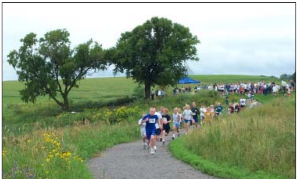
Visitors take off on the running course at the PWLC during this year's "Mosquito Run."