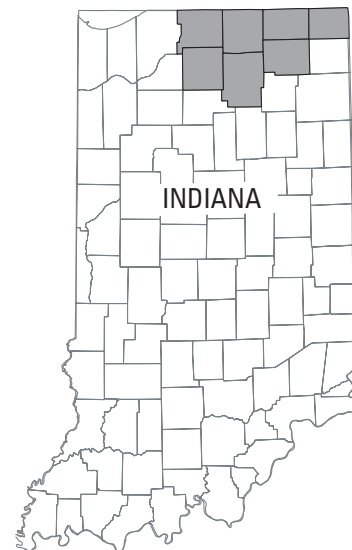
Figure 8.--Locations of lakes having water-level records for water year 2003.

▲ 04100180 ACTIVE LAKE STATION WITH SITE IDENTIFIER