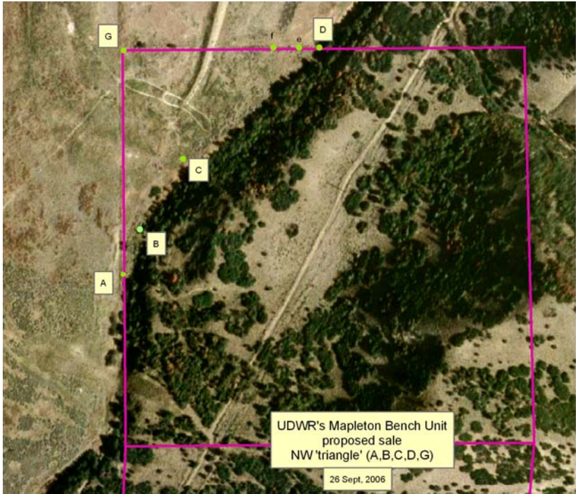
Photo B1. Aerial image taken before the damage was incurred on the DWR property proposed for sale, roughly outlined by the points described in the inset text. The pink line delineates DWR ownership, with north being at the top of the displayed image.