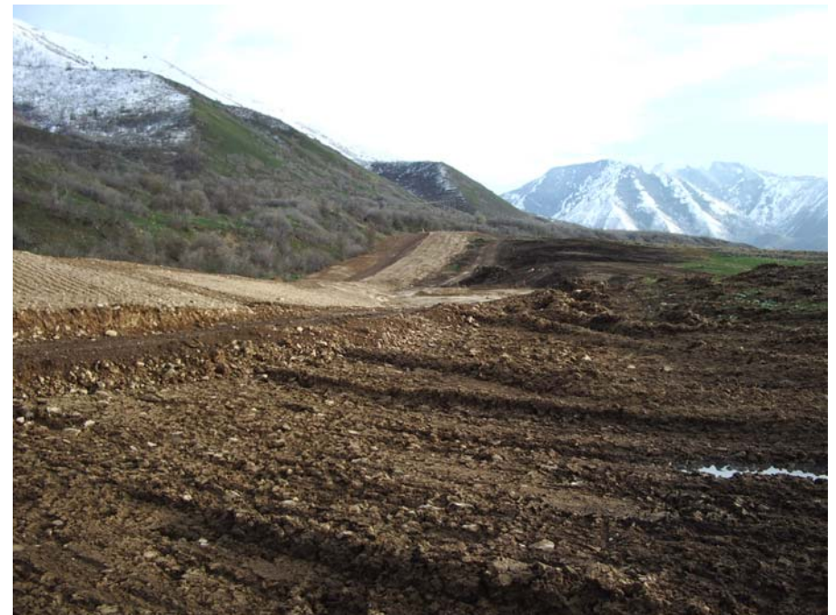
Photo B4. Observation after the damage occurred, from a similar location and orientation as Photo B3 (note the hill profiles in common between the two images). DWR land below the steep hillside is scarified or buried, with no vegetation remaining.