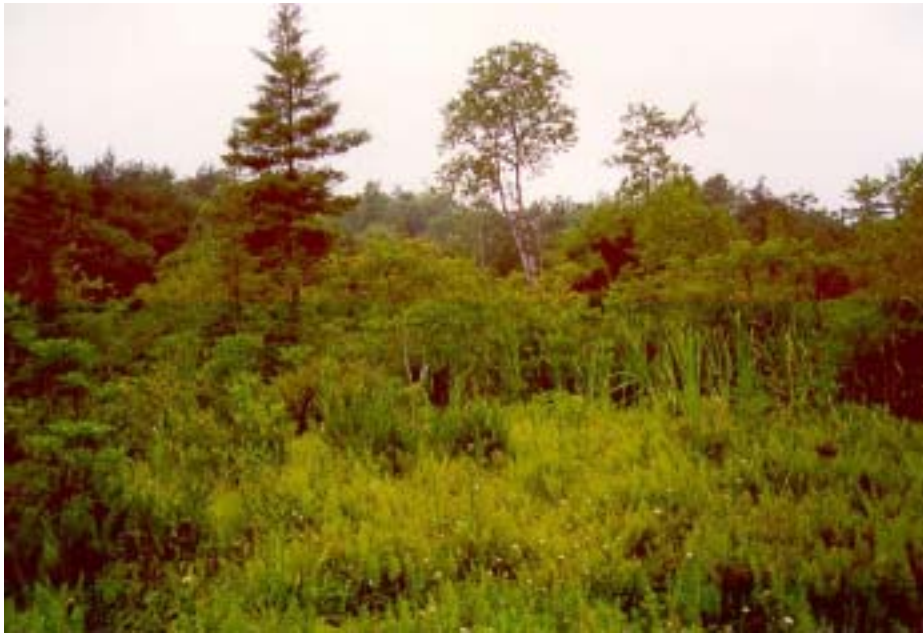
Figure 4. Photograph of Eriophorum tenellum habitat

Nemopanthus , Gaylussacia , Toxicodendron vernix , Ilex verticillata , Viburnum cassinoides , with scattered Abies balsamifera and Rhododendron maxima . The occurrence is in a sphagnum opening near the center of the bog (Western PA Conservancy 2001, Bissell 2001).